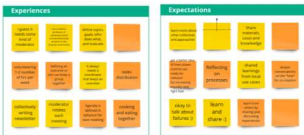
Figure 3: Experiences and expectations

The community did agree upon the need for some central coordination despite the co-owning nature of our community building agenda. Moreover, identifying dedicated tasks alongside the sharing of recurring tasks has been highlighted in order to make the process ahead of us a realistic and continuous endeavor.