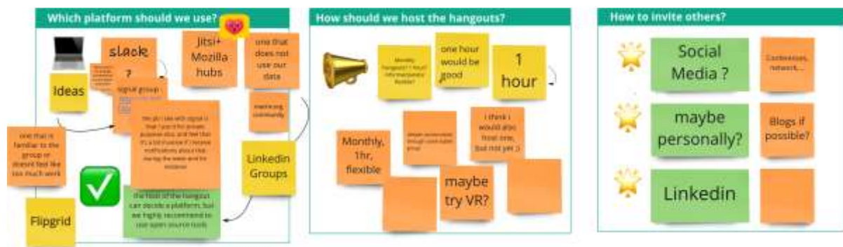
Figure 2: Platforms, formats, outreach and engagement

For the monthly hangouts we will not pre-assign a specific platform but leave it open to the respective members organizing a hangout which platforms and tools they wish to use. This allows us to address the needs of different members. Additionally, it allows the community to learn and try out tools some of us have potentially not yet been familiarized with. The community hangouts will provide a safe space for members, therefore not being publicly announced nor recorded.