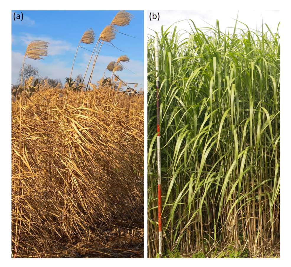
Figure 1. A 1.5-year-old (a) and a 5-year-old (b) field trial with Miscanthus \times giganteus (Greef et Deuter) in southwest Germany. The pictures were taken in December 2017 (a) and August 2019, respectively.

This large feedstock base offers ample options for the production of isobutanol, but ensuring sustainable production requires multiple economic, environmental and social aspects to be considered (Von Cossel, Wagner, et al., 2019). Of particular importance is the avoidance of direct competition with food production. This renders cassava, rice, wheat, and sorghum somewhat unsuitable feedstocks (Tilman et al., 2009).