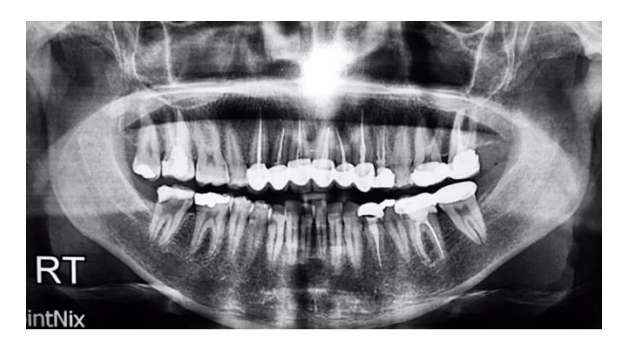
Fig. 1-Panaromic Radiograph

To confirm our diagnosis, we ordered a CBCT ( Fig. 2 ) and we rule out the presence of an extra rudimentary tooth. Since the tooth was causing discomfort to the patient, surgical removal was advised and carried out promptly. 80% of all supernumerary teeth are located in the anterior medial region of the maxilla. It's usually discovered as a result of a patient's complaint or when they seek treatment for malocclusion or bony swelling. Performing the appropriate and detailed image analysis is critical for correct diagnosis in locating and identifying the positioning of the tooth, and for efficient surgical planning.