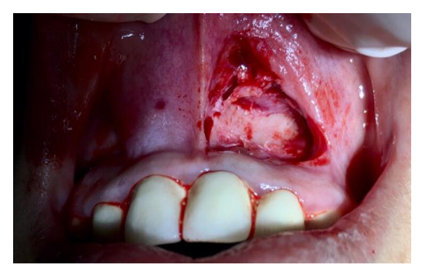
Fig. 3- Flap Reflection and ST removal

5. The surgical area was sutured with silk thread 4.0.