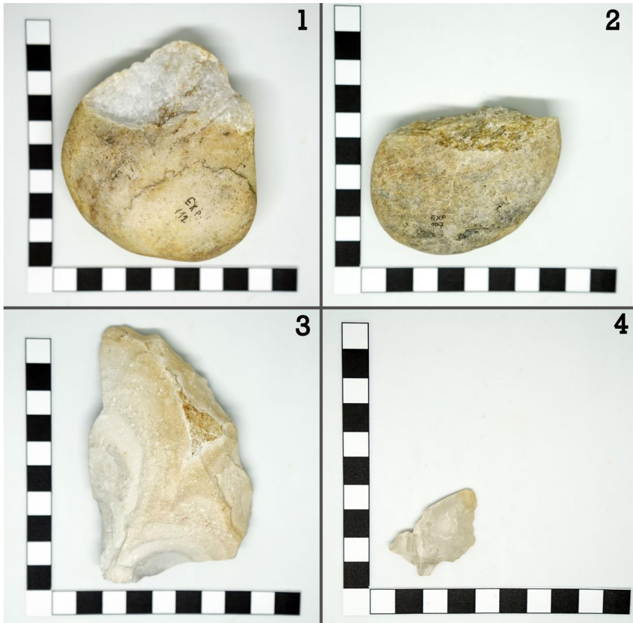
Figure 1. Tools made by the subjects during the experiment: 1) Example of a well-made chopper, 2) Example of a poorly made chopper, 3) Example of a well-made scraper, 4) Example of a poorly made scraper. The well-made chopper has two contiguous flake scars that form a continuous sharp edge, as opposed to the poorly made example whose edge is almost perpendicular to the surface of the pebble. On the other hand, the well-made scraper is a large and clearly identifiable flake with a continuous semi-steep retouched edge (the retouch scars are large and well-spaced), whilst the poorly made scraper is not a flake per se, but a thin chip with no unambiguous knapping attributes (i.e., bulb of percussion and platform) and a retouched edge with shallow and short scars, more reminiscent of edge damage than true retouch.