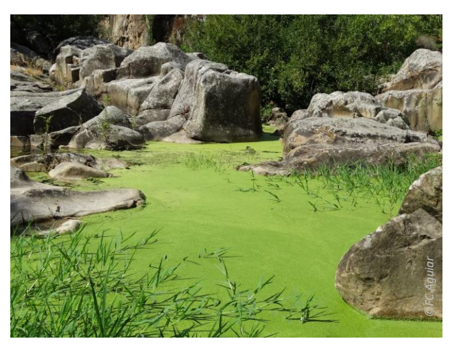
Common duckweed (Lemna minor) and knotgrass (Paspalum <u>distichum</u>) in eutrophic waters downstream a dam.

Besides trophic status, macrophytes also respond to sediment loads, hydromorphological alterations, light, water hardness, acidification, flow velocity, hydropeaking and diverse human-induced hydrological alterations, amongst other stressors.