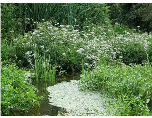
Macrophytes in a small-sized stream (hydrophytes and helophytes).