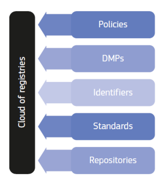
Figure 2. The essential components enabling the FAIR ecosystem (Figure 6 of Turning FAIR into Reality report).

It is important to emphasise that in addition to making digital objects FAIR, it is essential that they are kept FAIR over time. This is a task that usually requires resources and usually domain specific expertise. The preservation aspect is often underestimated or forgotten in the ongoing discussion.