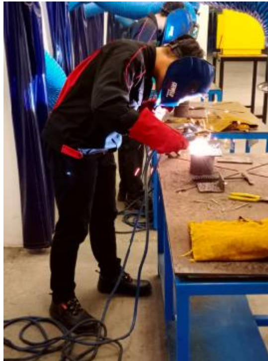
Figure 1 Body position during lab work welding process

According to figure 1, the findings showed at figure 2 that all body parts have discomfort. But they level are different