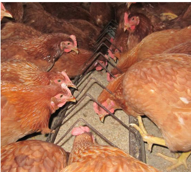
Laying hens.

Pea is used in livestock feed primarily because of its protein content. The dry matter is about 24% protein and also contains energy-rich ingredients such as starch, oil and sugar (Table 1). The nutrient contents vary depending on