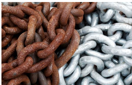
Fig. 2 - Loss from Corrosion.

Corrosion is a crucial factor that limits the lifetime of many metallic structures and it's one among the first means by which materials deteriorate, especially in humid and saline environment (Zhanlong Zhang, Pan Gao, Jing Zou, Guohua Liu, Yihua Dan & Daojun Mei (2018). Corrosion is an accumulative process that alters the surface property and fracture strength of structures, leading to premature deterioration. Because the structural components ages, the occurrence of corrosions increases. Additionally, corrosion occurrence is independent of usage. Inspection for corrosions is time consuming, costly and sometimes causes additional damages since corrosions mostly occur at inaccessible locations that can't be inspected visually. Corrosion may be a persistent problem which will only be managed but not eliminated. The impacts on cost saving and safety assurance would be significant if hidden corrosions are often detected without disassembly (Zhanlong Zhang, Pan Gao, Jing Zou, Guohua Liu, Yihua Dan & Daojun Mei (2018).