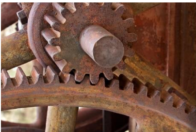
Fig. 4 - Corrosion Products on steel Surface.

Corrosion products formed on a steel surface mainly contains various iron oxides, iron hydroxides, and iron oxy-hydroxides. The morphology and phase composition of the corrosion products are important since the corrosion rate and properties of substrates are strongly suffering from the characterization of the corrosion products layer. The corrosion process of iron in aqueous solutions includes re-oxidation and reduction of iron (II) and iron (III) ions. The iron is dissolved as iron (II) ions into the answer, and these ions are precipitated onto the metal surface because the corrosion products layer (Junlei Qian, Changchun Hua, Xiping Guan, Tiefeng Xin & Limin Zhang 2019). Moreover, a high concentration of chloride ions causes the formation of akaganeite ( \beta -FeOOH) with an acicular shape structure.