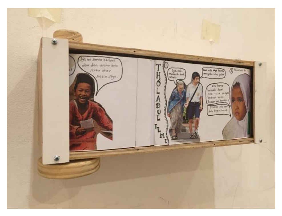
Figure 4 Second Students' Comics Display

After the video tutorial was considered suitable for use, the video tutorial was sent to each student's smartphone with the aim to be accessible at home and become a guide to work in comics creating without depending on face-to-face learning at school. By utilizing the video tutorial, each student was able to do comics creating according to the correct steps, from making a script and story board, sketching, outline and coloring to comic display.