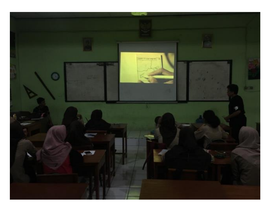
Figure 1 Video Tutorial Presentation