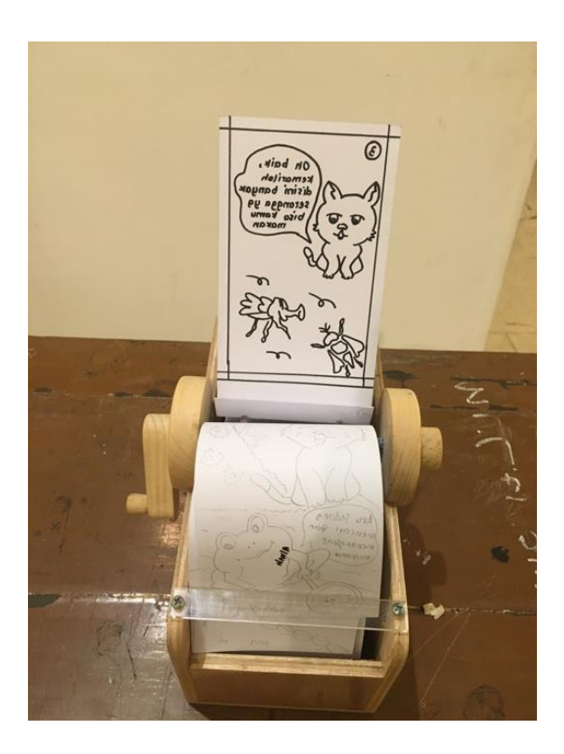
Figure 3 First Students' Comics Display