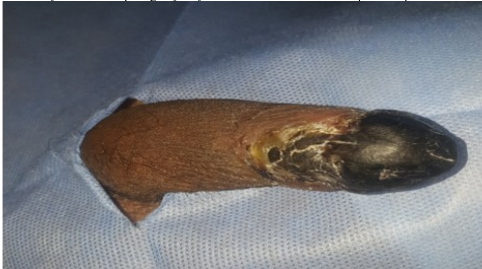
Picture 1:- Necrosis of the glans penis that extends to the ventral face of the penis.

Prevention is essentially based on depistage by a systematic examination of the penis of patients at risk.