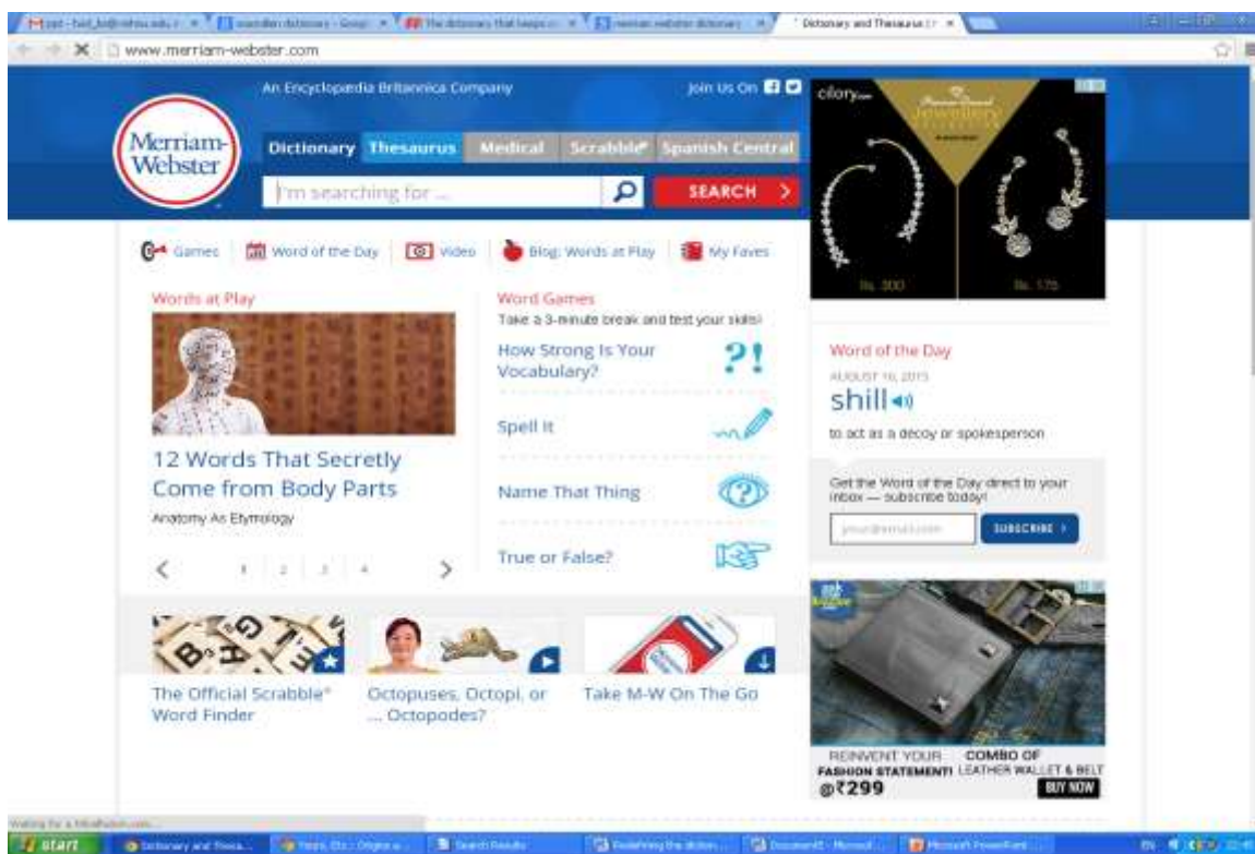
Merriam Webster Dictionary (Online Dictionary)

Generally dictionaries offer meanings of words, spelling, pronunciation, etymology, grammatical references, synonyms and antonyms and usage. Online dictionaries now expand their purview offering additional features. Collins English Dictionary provides a dictionary, thesaurus, translator, and interesting information about words and word games for word buffs and also blogs. Word for the day is a common option provided by many online dictionaries. Merriam Webster of the Encyclopedia Britannica Company, in addition to the corpus of words for meanings, also reaches out to the language enthusiasts with quizzes, word of the day (for which the reader has to subscribe).