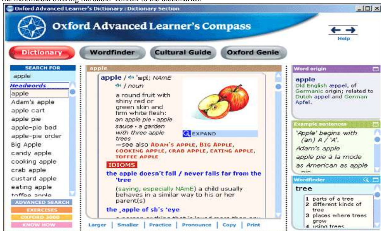
Oxford Advanced Learner's Compass (CD ROM)

was easy for the user to type in the word and refer the word of his or her choice. The print form was soon enriched by the multimedia offering the audio content to the dictionaries.