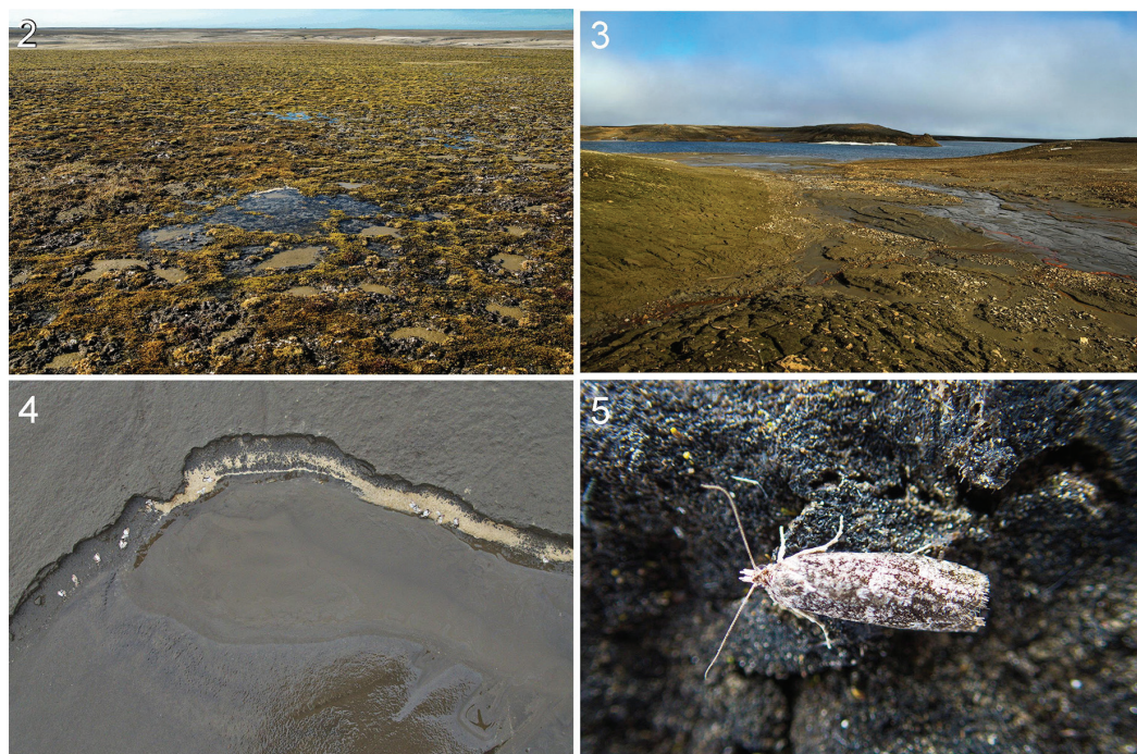
Figures 2–5. Examples of habitats on Vize Island and moths Zeiraphera griseana (Hübner, 1799). 2. The typical landscape: forb and cryptogam high-Arctic tundra. 3. Shallow river valley, at the sandy banks of which dead moths were observed. 4. Dead moths at the stream bank. 5. Live moth sitting on the ground.

41 species of ground lichens (Zhurbenko and Konareva 2015) and 5 species of lichenicolous fungi (Zhurbenko 2015). No terrestrial invertebrates have been recorded on Vize Island so far.