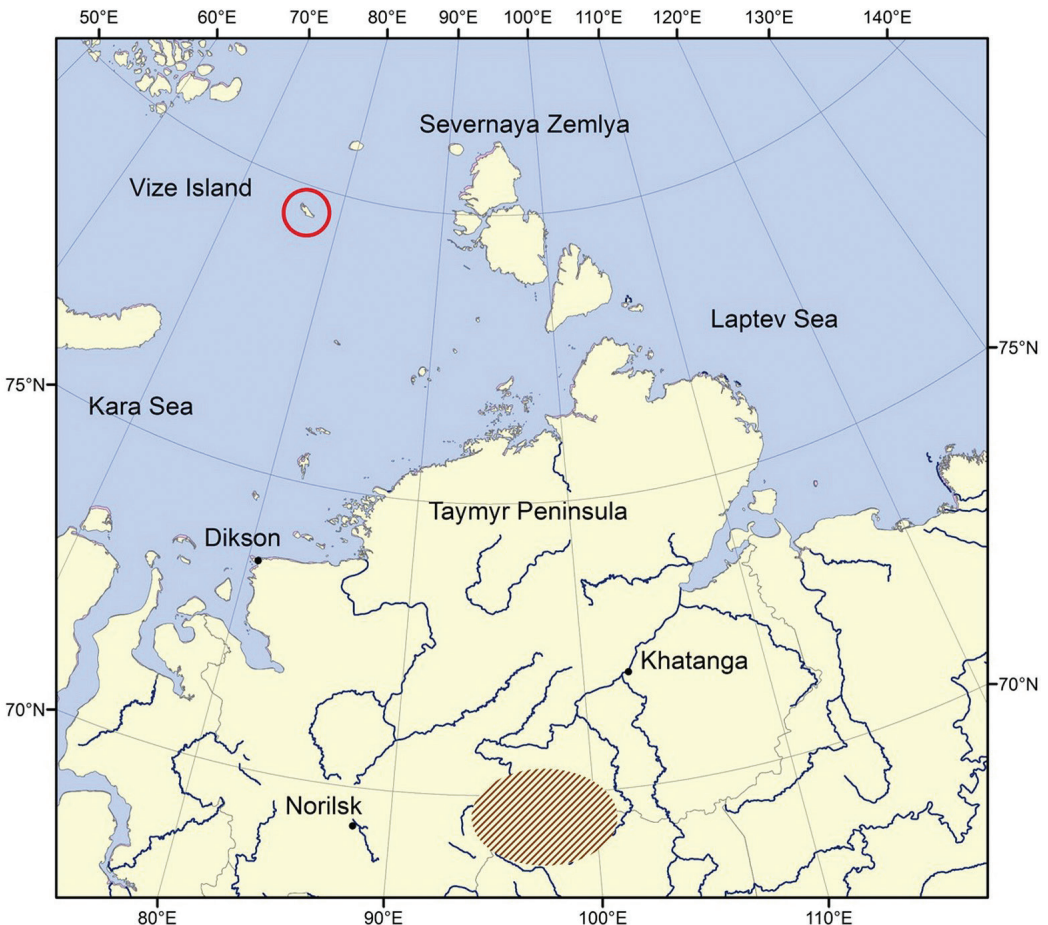
Figure 1. Location of Vize Island (red circle) and of an outbreak of Zeiraphera griseana (Hübner, 1799) recorded in 2020 (shaded area).

Vize Island (discovered in 1932) is located in the northern part of the Kara Sea (79°30'N, 76°59'E), 575 km from the mainland and 275 km from the Severnaya Zemlya Archipelago (Fig. 1). This small (288 km 2 ) ice-free and hilly lowland island (the highest elevation is 22 m above sea level) has many rivers and streams (Figs 2, 3). The mean air temperatures are positive only in July and August (0.5 °C and 0.1 °C, respectively). The uniform landscapes are dominated by forb and cryptogam high-Arctic tundra (classification follows Walker et al. 2005). Vascular plants and lichens cover 5–10% and 10–15% of the ground surface, respectively. The most common of 20 species of vascular plants known from this island (Safronova and Khodachek 1989; M. Gavriilo personal observations), listed in decreasing order of importance, are Saxifraga oppositifolia L., S. cespitosa L., Papaver radicum Rottb., Cochlearia groenlandica L., Cerastium regelii Ostenf., Saxifraga cernua L., S. hyperborea R.Br., S. foliolosa R.Br., and Cerastium bialynickii Tolm. This island also hosts 31 species of mosses (Afonina 2015), 10 species of liverworts (Potemkin 2014),