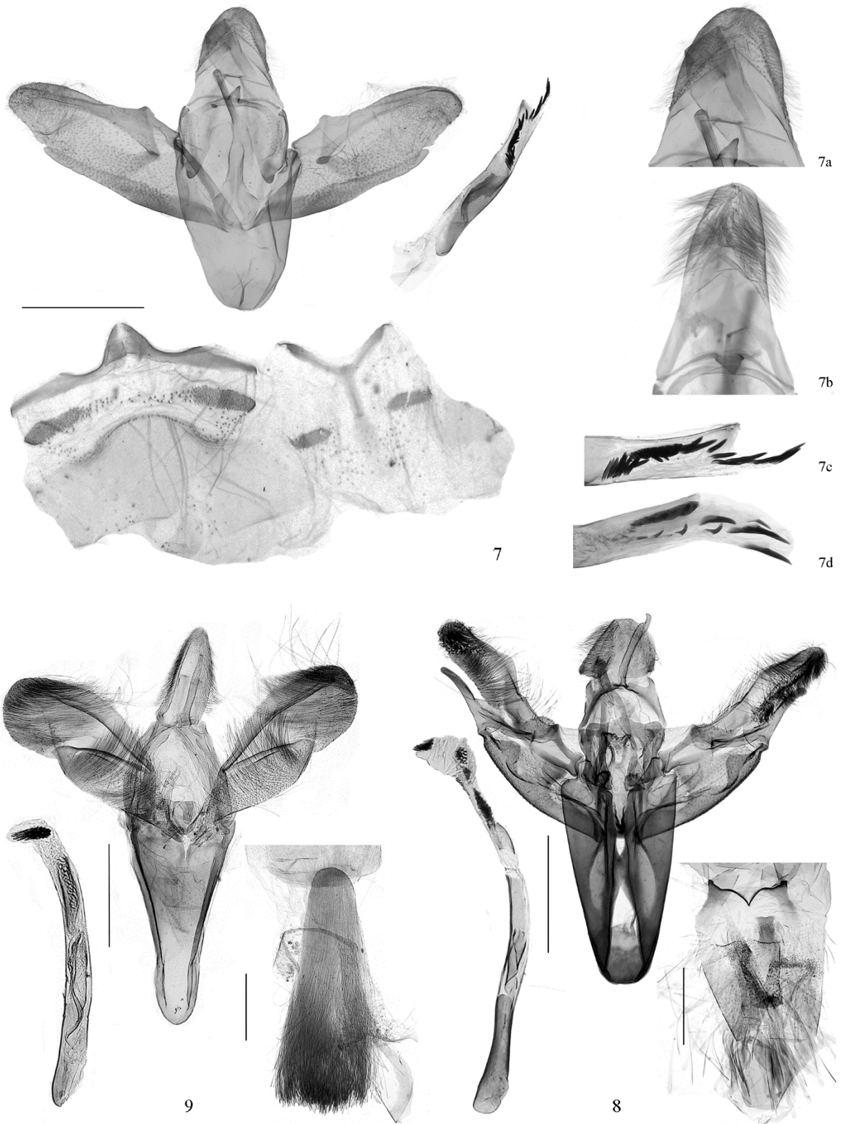
Figures 7–9. Cathyalia spp., male genitalia. 7. C. okinawana , slide No. RYD04428 (a. Uncus, slide No. RYD04428; b. Uncus, slide No. LHX14086; c. Cornuti, slide No. RYD04428; d. Cornuti, slide No. LHX14086). 8. C. fulvella , slide No. LJY10259. 9. C. pallicostella , slide No. LJY10244. Scales bar=0.5 mm.

distally setose. Aedeagus slender, slightly arched, about 1.3 times length of valva; cornuti consisted of a cluster of needlelike