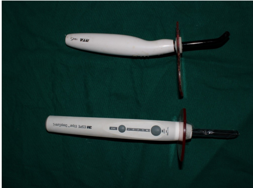
Figure 2:- Woodpecker RTA Mini-S (Top)Elipar Deep cure L (Below).