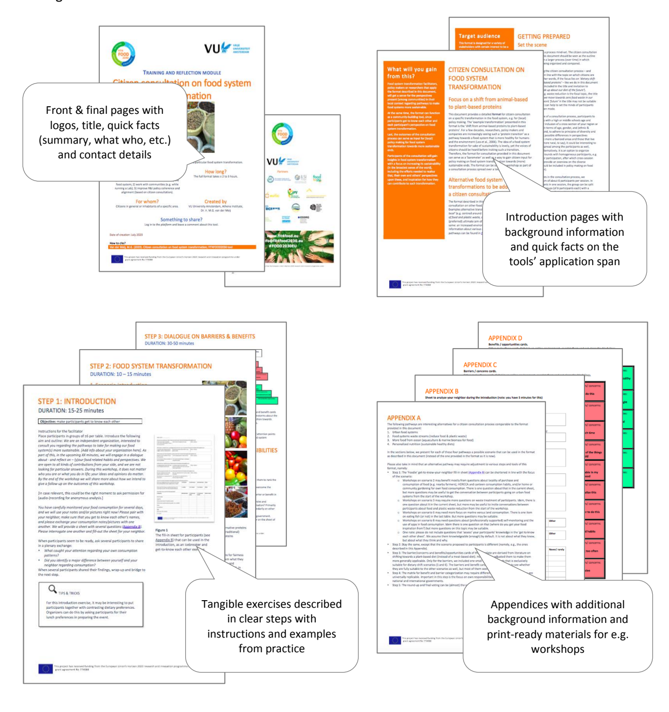
Figure 2: The FIT4FOOD2030 tool-format design characteristics.

Building on the results of these workshops, the Working Group collected all the tools developed in the project so far and made a uniform template for all the tools, see Figure 2. The scope of application for each tool is wider than the original test setting – food system transformation – only. The partners responsible for the deliverable or material that formed the basis for the specific tool, filled in the template. In developing the final version of the different 'tools', FIT4FOO2030 partners sought a balance between being very specific in terms of instructions on the one hand, but also to facilitate degrees of freedom, to allow for more general applicability of the tools for various types of system change facilitation worldwide.