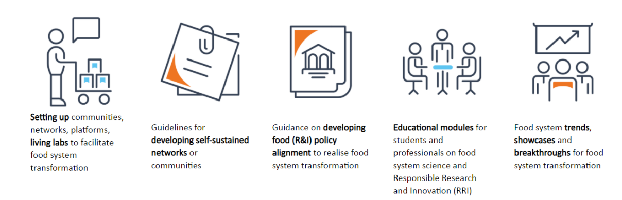
Figure 1: Overview of the many possible purposes of the different FIT4FOOD2030 tools.

As the finalization of the Knowledge Hub is still work in progress until the end of the project (December 2020) and the Knowledge Hub itself represents Deliverable 1.6 (updated and final version of all instruments and tools), this document only describes the key features of the (process towards developing the) Knowledge Hub. Please refer to the Knowledge Hub to review the contents of this deliverable.