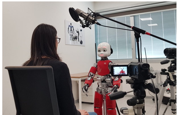
Figure 1: The robot iCub interviewing a participant for the IO IIT OpenTalk magazine

Figure 1 shows some of the multimedia devices involved, as well as the interviewer's (iCub) and interviewee's (human) position; who were the only ones present in the room. The experiment followed a Wizard of Oz technique (WoZ); i.e., the experimenter controlled the robot from an adjacent room (monitoring the situation through an USB camera and ambient microphone). Additionally, 2 HD and 2 USB cameras (two pointing at the interviewer and the other two at the interviewee), a condenser microphone, and the Shimmer sensor were also included to monitor physical and physiological features.