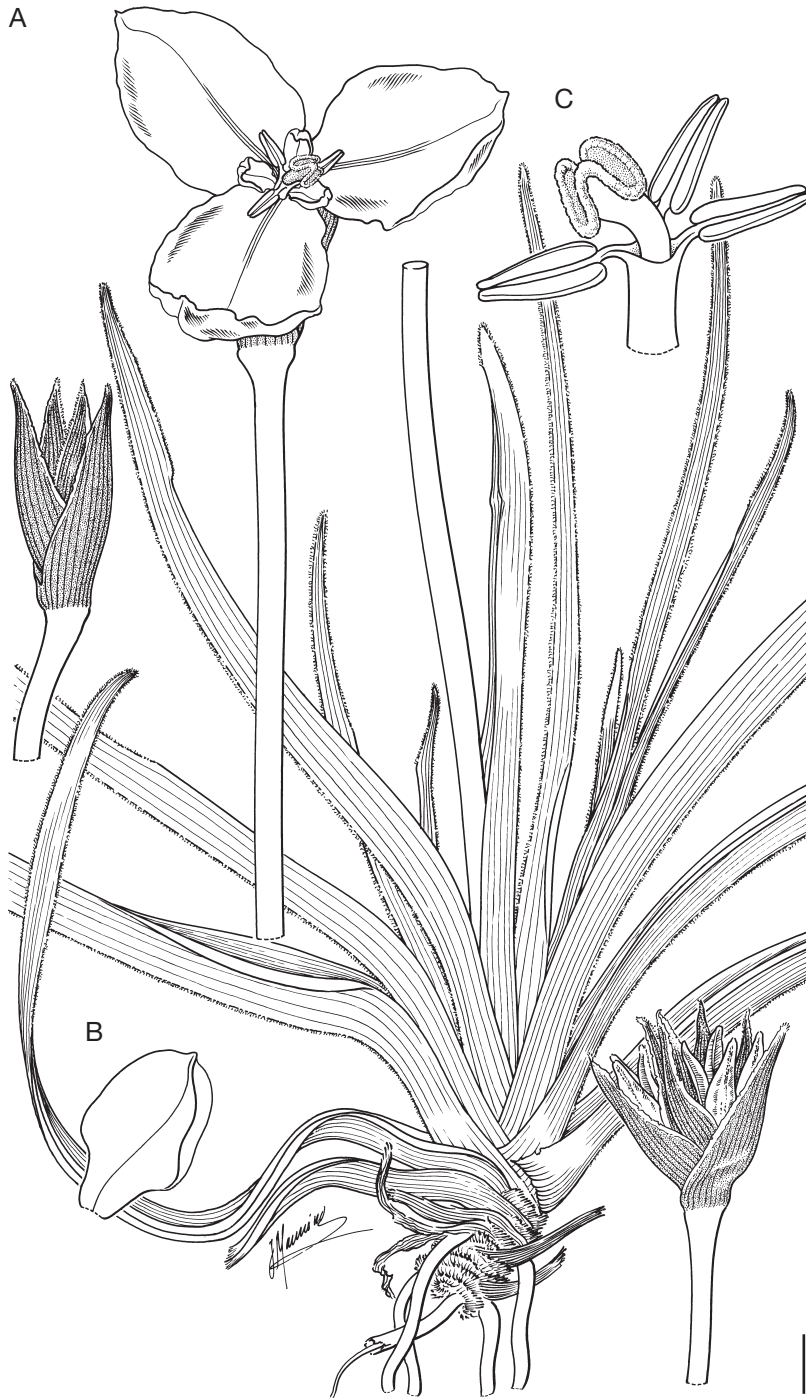
FIG. 1. — Patersonia neocaledonica Goldblatt & J.C. Manning sp. nov.: A , habit, including separate young inflorescence and infructescence; B , inner tepal; C , detail of anthers and stigma. Pillon et al. 1156 (MO). Scale bar: A, 10 mm; B, 2 mm; C, 2.5 mm. Drawing by John Manning.