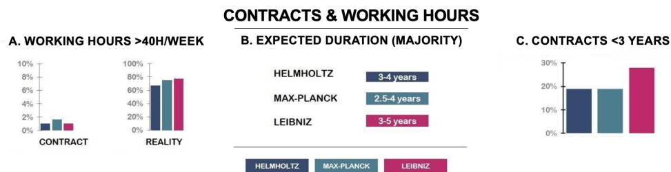
Figure 3: Employment situation and working hours of DRs in the N 2 member organizations.

On the other hand and more commonly, supervisors can use the threat of a bad thesis evaluation to compel work from the DRs beyond what has been contractually agreed upon – for example when it comes to scientific publications. The duration required to publish in an academic journal varies greatly, depending on the journal and field. Although the researcher can assess the average time it takes from submission to acceptance for a specific journal, once the article is submitted, they no longer have control over how quickly the submission progresses through the peer review system (Huisman & Smits, 2017). In turn, this can delay the thesis completion by many months.