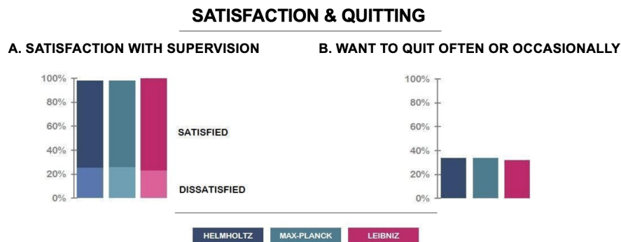
Figure 2: Satisfaction with supervision and aspects of academia.

universally show that DRs perceive the strong and multiple dependencies between them and their supervisors as problematic, leading to dissatisfaction, mental health problems 3 and thoughts about quitting.