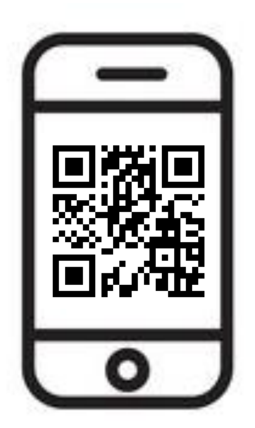
Scan QR code