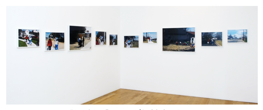
Figure 9: Installation view of Paul Graham Austin, Texas 2006 from a shimmer of possibility at Anthony Reynolds Gallery, London 2007.

The affordances an artwork offers can be quite different depending on the situation of the encounter.<sup>29</sup> When a viewer enters a public exhibition space, the aspect of aesthetic education is the focus of interest. But when a viewer enters a private gallery, the situation is different. Here it is a matter of purchase. The question of how expensive such a photographic sequence is and whether it is still available for purchase at all is standing in the room. A shimmer of possibility was first exhibited at Anthony Reynolds Gallery, London from September 13 to October 14, 2007. Austin, Texas 2006 was installed over a corner (fig. 9). The first five photographs were hanging on the left wall and the second five photographs on the right wall. The hanging was done by the artist himself.