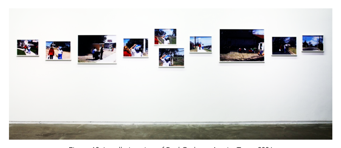
Figure 10: Installation view of Paul Graham, Austin, Texas 2006 at The Douglas Hyde Gallery, Dublin 2012.

One and the same photographic sequence affords something completely different in a public exhibition space than in a private gallery. In a museum, viewing the work educates the viewer aesthetically. In 2012, the photographical sequence Austin, Texas was shown at The Douglas Hyde Gallery, Dublin (fig. 10). The arrangement of the photographs is slightly different. The pictures are hanging on a single wall and the viewer can approach them orthogonally. Once again, the hanging was done by the artist himself.