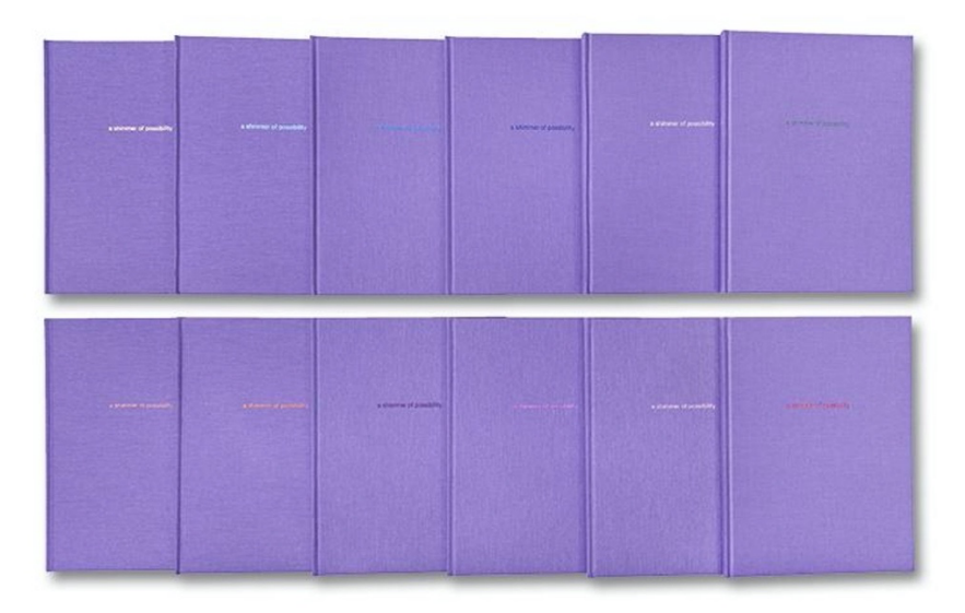
Figure 3: Paul Graham, a shimmer of possibility, reprint 2018.