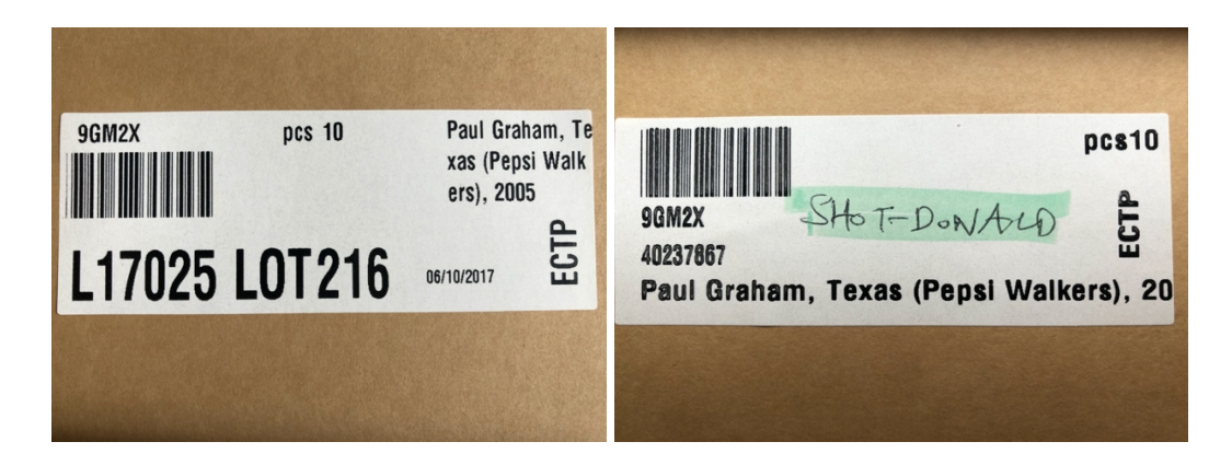
Figure 7 and 8: Sticker of Sotheby's, London, 2017.

Furthermore, it contains four stickers with valuable information. The most important is from Anthony Reynolds Gallery, 60 Great Marlborough Street, London. It contains the artist's name, the title of the work Texas Pepsi Walkers from the series a shimmer of possibility; plate 5", which in this case differs significantly from the title and the year in the photobooks (fig. 6). It dates the sequence back to the year 2005, although the photobook indicates 2006 as the year of creation. Furthermore, the sticker contains information about the size of the photograph, the number of the plate, the size of the edition (Edition of 5 + 1 artist print) and the number of the edition (1/5). Then there are two stickers from Sotheby's London, where the work was auctioned in 2017, containing the lot number 216, the number of sold pieces (pcs 10) (fig. 7) and the name of the photographer, Shot-Donald (fig. 8).