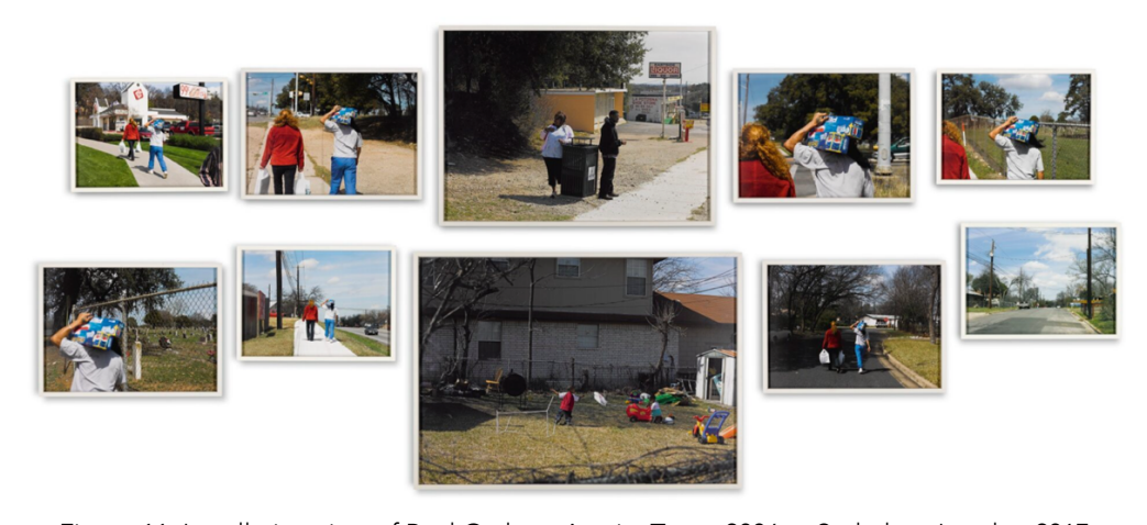
Figure 11: Installation view of Paul Graham Austin, Texas 2006 at Sothebys, London 2017.

In a gallery or auction house, the artwork affords a price at which it can be purchased. A gallery or auction house is acting like a broker or agent who offers a work of art he or she has suggested as relevant for an audience. However, demand must be added to supply. The gallery cannot force this. One edition of the photographic sequence of Austin, Texas 2006 was sold at Sothebys, London on October 6, 2017. The pictures hung in two rows, an assembly which Graham often uses, also for other sequences of a shimmer of possibility (fig. 11).