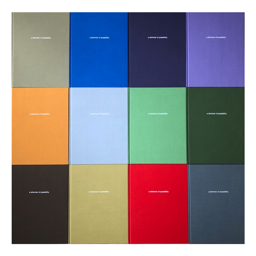
Figure 1: Paul Graham, a shimmer of possibility, first hardcover edition, SteidlMACK 2007.

In May 2009 a shimmer of possibility was published once again in a softcover paperback edition in a minimally smaller format of 24.2 x 31.8 cm and with 367 pages as a whole book (fig. 2). In contrast to the first edition, the photographs in this edition are overprinted with a light clear varnish to make the colours appear deeper and more saturated. The paper is thinner and glossier. <sup>23</sup> In 2018 the publishing house MACK Books London decided to reprint the twelve volumes. In the reprint edition, all volumes are bound in the same light blue-violet linen (fig. 3). The title is printed in the colours of the first edition. These are the three primary, material manifestations of a shimmer of possibility. Quantitatively speaking, most people will only have access to the paperback edition and no access to the 12 hardback volumes either of the first or the third edition or the original photographs.