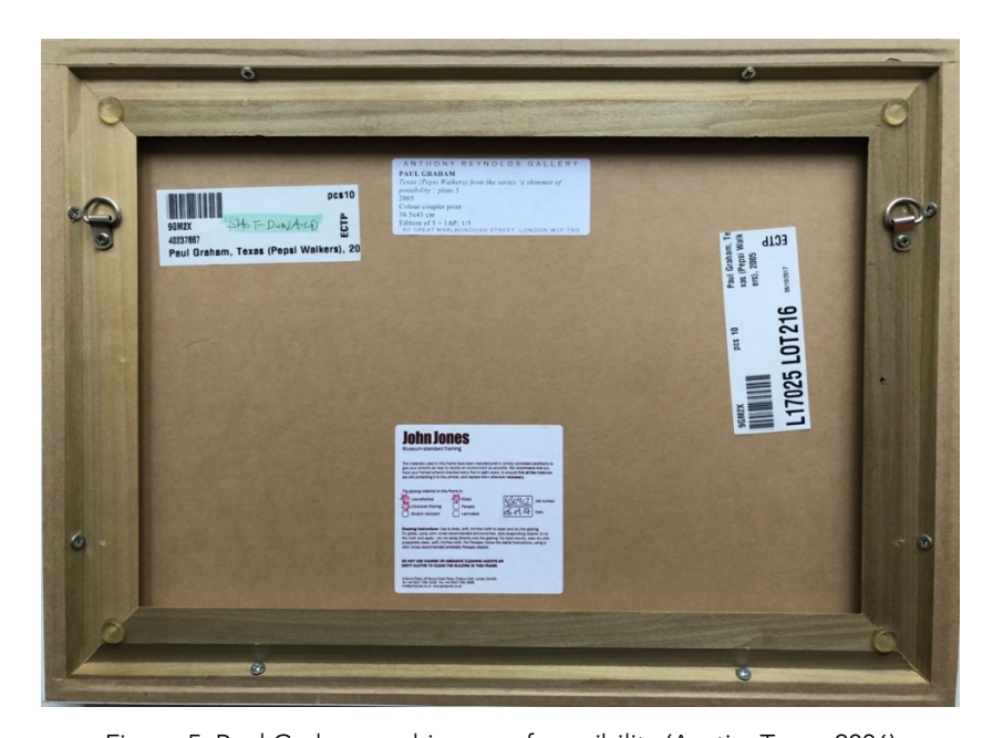
Figure 5: Paul Graham, a shimmer of possibility (Austin, Texas 2006) detail of backside of plate 5