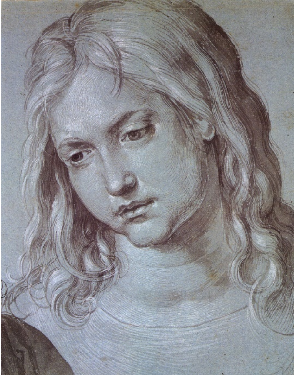
Figure 3: Albrecht Dürer, 1506, Head of Christ drawing on blue Venetian, paper, pencil, heightened with white, 27,5 × 21,1 cm, Albertina, Wien, Inv. 3106 (public domain: http://www.zeno.org )