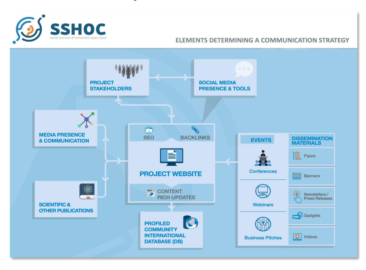
FIGURE 5: ELEMENTS DETERMINING AN EFFECTIVE COMMUNICATION STRATEGY.

SSHOC will use various communication channels leveraging on the project partner networks and will produce a set of tailored communication formats targeting different stakeholder groups. The main channels that will be utilised in SSHOC are visualized in the figure below: