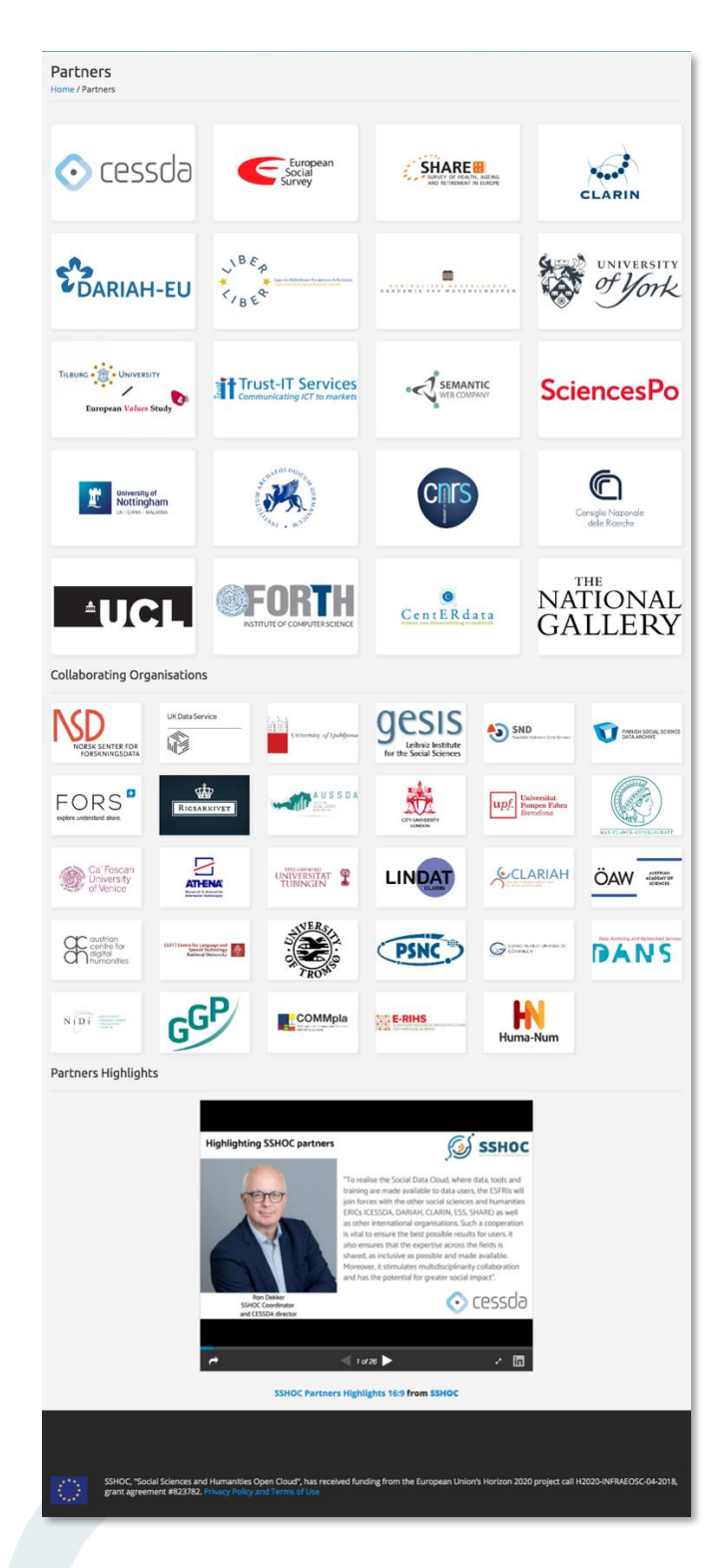
FIGURE 4: UPDATED PARTNER PAGE WITH 3RD LINKED PARTIES AND EMBEDDED SSHOC PARTNER HIGHLIGHTS PRESENTATION