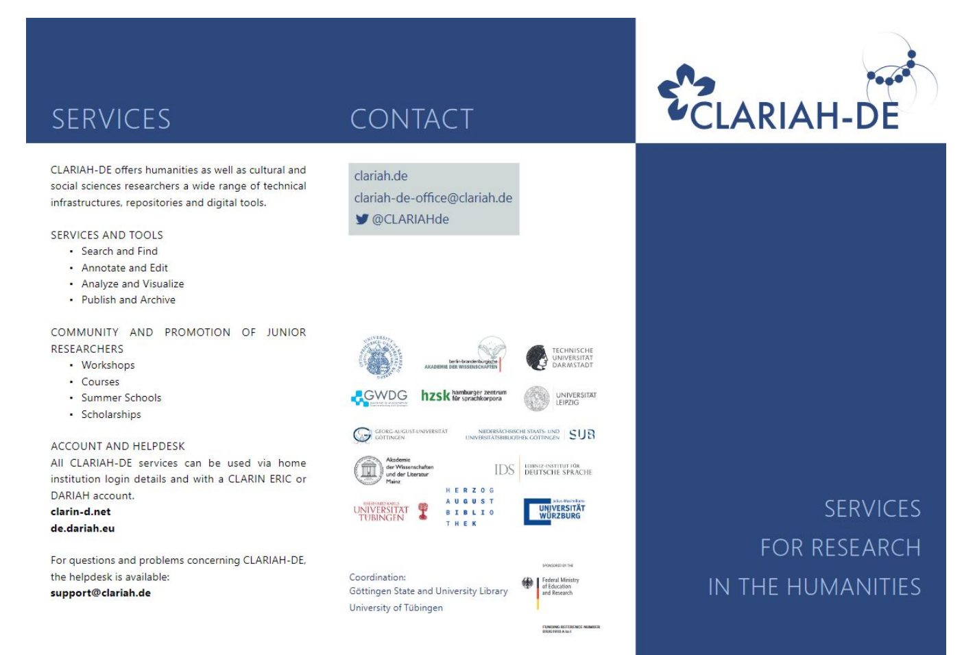
The CLARIAH-DE Flyer