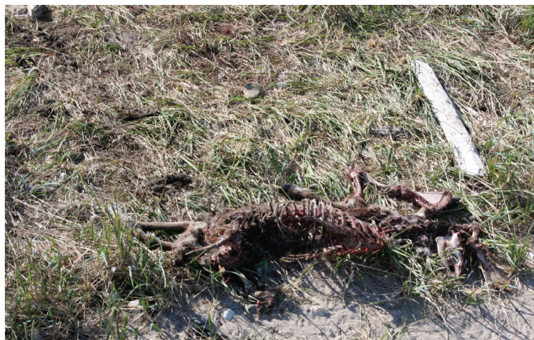
FIGURE 6. Remains of a caribou calf in a day bed on Point Pakulak (28 July 2007).

the south along the willow fringe (cf. Derocher et al., 2000). The bears stopped approximately 300 m south southeast of the tower and began eating the calf. The female ripped open the abdominal cavity and she and the cub fed on the thoracic and some abdominal organs. After about 2 hours, the bears retreated about 25 m into 2–3 m tall willows and bedded down. The cub appeared to remain asleep while the female periodically raised her head, looking in the direction of the carcass. At about 12:00, a large, male polar bear approached the carcass from the north and proceeded to feed on the left rear rump and leg. The sow increased the frequency of head raises and eventually sat upright. After about 10 minutes, the cub retreated approximately 25 m inland. The male continued foraging. After another 10–15 minutes, the female charged at the male while vocalizing loudly. The male retreated north about 200 m and sat and watched as the female approached the carcass and dragged it back toward the bed she and the cub had occupied. The male slowly moved north and east across La Pérouse Bay. The female and cub remained in the area for another 2–3 days, feeding on the remains of the carcass.