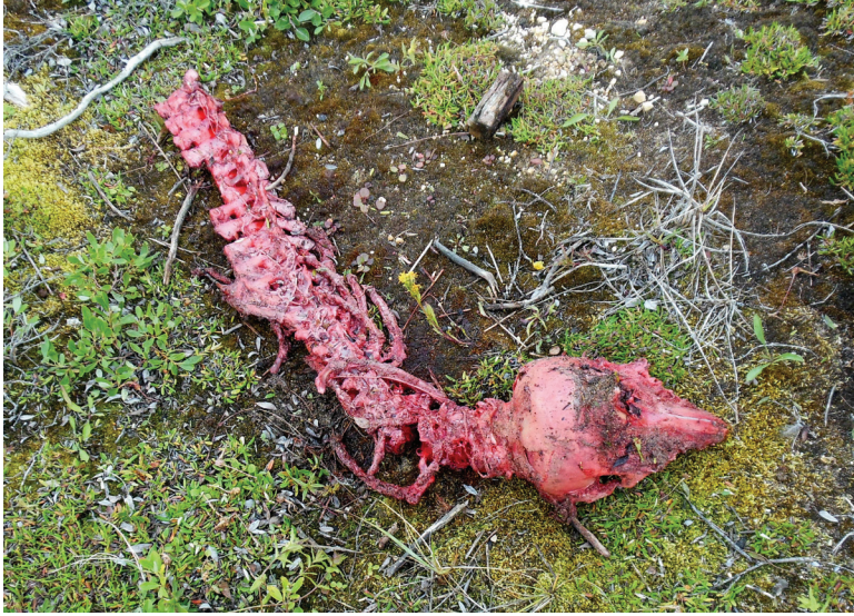
FIGURE 10. Remains of a beluga whale calf in the day bed of a polar bear that had just left on August 11, 2015.

past the tower and appeared to be sniffing about the bases of the 1–2 m tall willows that formed the interior extent of the coastal snow goose nesting habitat at that time. Periodically, they would grasp the base of a willow shrub with their mouth and pull it from the ground, often shaking it. They would then chase something and crush it. After a flurry of such activity at a bush they would sit and eat. Closer inspection with a spotting scope during the “eating” phase revealed they were consuming what appeared to be lemmings. Inspection of the sites after the bears left revealed the smashed carcasses of several collared lemmings. It is possible other species were consumed, but the collared lemmings were the only remains found. Similarly, Pedersen (1962) describes polar bears capturing the “quick-moving lemmings by turning over the stones under which they were hiding.” Miller and Woolridge (1983) report a female polar bear catching and eating a small rodent that they thought was likely Microtus pennsylvanicus in the Churchill area.