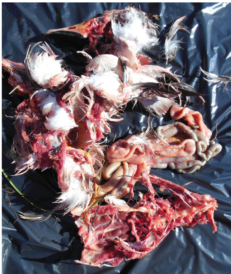
FIGURE 2. Remains of an adult white-phase lesser snow goose. Typically, the breast, legs, thighs, gizzard, heart, and liver are consumed. In this individual some of the liver remains (29 July 2013).

The gosling(s) was (were) carried back to the hiding spot and consumed. After eating, the bear again waited and charged the next passing family. One of the two bears observed ambushing in this fashion continued it for nearly two full days successfully capturing goslings from at least 20 families.