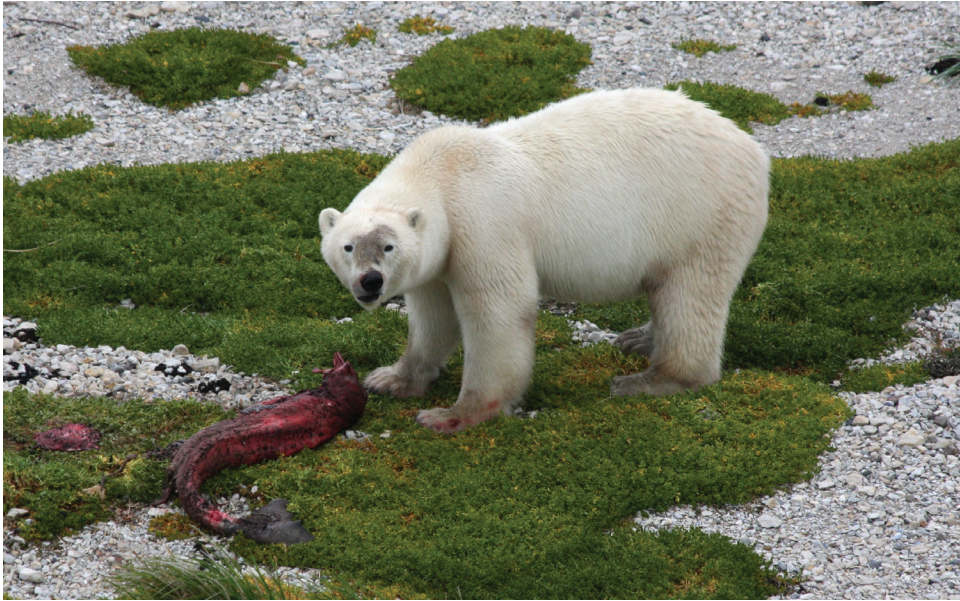
FIGURE 9. Polar bear eating the remains of a seal on a gravel spit near the Seal River, 14 August 2010.

the skin and subcutaneous fat. Although this prevented certain identification, ringed seals are common in this area, often basking on gravel spits and feeding on fish at the mouth of the river (fig. 9). R.F.R. and L.J.G. observed several cases where polar bears appeared to patrol the shoreline and stalk seals that were hauled out along areas of braided rivers. The stalking behavior is similar to that described above for birds and is likely how the seal being consumed at the Seal River was obtained. Remains of seals are regularly found in coastal day beds of polar bears (R.F.R., personal obs.).