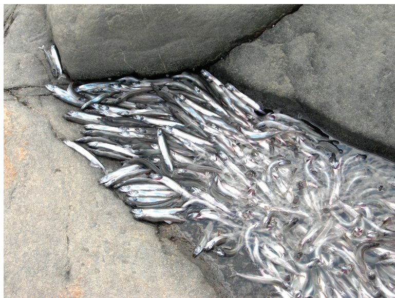
FIGURE 11. One of many remnant collections of dying capelin trapped in the rocks near Churchill on 8 July 2009.