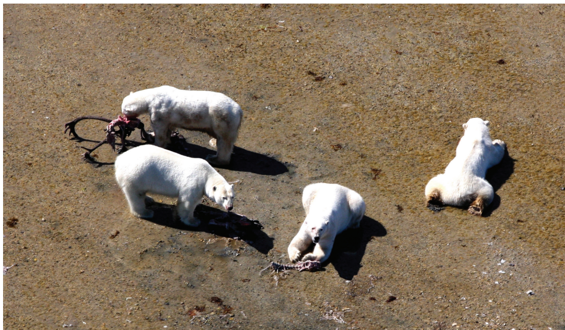
FIGURE 8. Four adult polar bears eating the remains of a bull caribou on Kiyask Island, 8 August 2012.

the open, deeper water of the outgoing tide. The bear cut the seal off and in about 5 minutes of maneuvering managed to keep the seal between itself and the shore and close the distance between them to about 10 m. The bear began stalking closer and finally rushed and grabbed the seal by the head. It dragged the seal onto the spit and slapped the carcass to the ground several times while still holding it by the head. The bear then sat and consumed much of the seal. Unlike the deeper water seal capture reported by Furnell and Ooloooyuk (1980), this polar bear took advantage of shallow water produced by an outgoing tide.