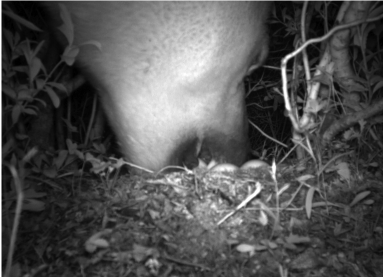
FIGURE 5. Polar bear eating eider eggs at 03:45 on 19 July 2016.

D. Other examples of polar bear egg foraging include: snow geese in western Hudson Bay (Abraham et al., 1977; Rockwell and Gormezano 2009) and Coats island, Nunavut (Smith et al., 2010), Canada geese on Akimiski Island, Nunavut (Smith and Hill, 1996), little auks ( Alle alle ) on Hooker Island in Frans Josef Land (Stempniewicz, 1993), thick-billed murres on Coats Island (Smith et al., 2010), barnacle geese (Drent and Prop, 2008) and light-bellied brent geese ( Branta bernicla hrota ) in Svalbard, Norway (Madsen et al., 1998).