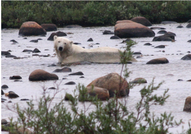
FIGURE 3. After chasing, capturing, and consuming at least three snow geese, this subadult polar bear submerged and lounged in the Mast River on 13 August 2013.