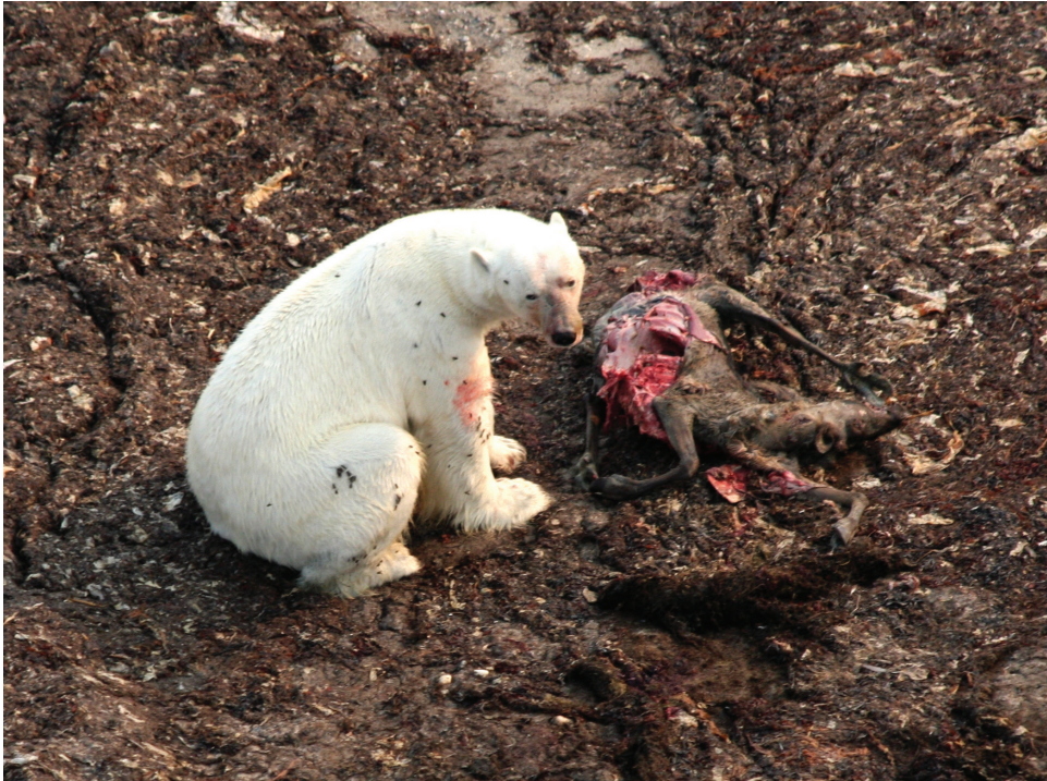
FIGURE 7. Polar bear consuming a recently killed caribou calf on a sand spit near the Broad River on 26 July 2010.

when one or two individual caribou became separated from the herd, the yearling bear chased them while the female tried to get between the individual(s) and the herd. During approximately 60 minutes of observations, the bears were not successful.