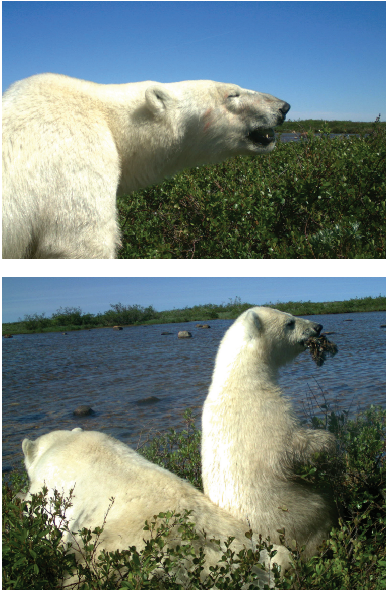
FIGURE 4. A. This is one of many eider eggs this female polar bear consumed from 25 June to 6 July 2013. B. Her cub is seen chewing on remains of the predated nest bowl.

C. Since 2000, there have been numerous observations of polar bears on the snow goose nesting colony during the incubation period. On several occasions bears have been seen through binoculars consuming eggs. Later inspection of the nests revealed egg predation even when actual foraging was not observed. Beginning in 2012, we deployed trail cameras at snow goose and eider nests and inspection of the imagery revealed numerous cases of egg predation by mothers with cubs of the year, mothers with yearlings, subadults, and even one large, obese male. These images revealed that egg predation happens at night as well as during the day (fig. 5).