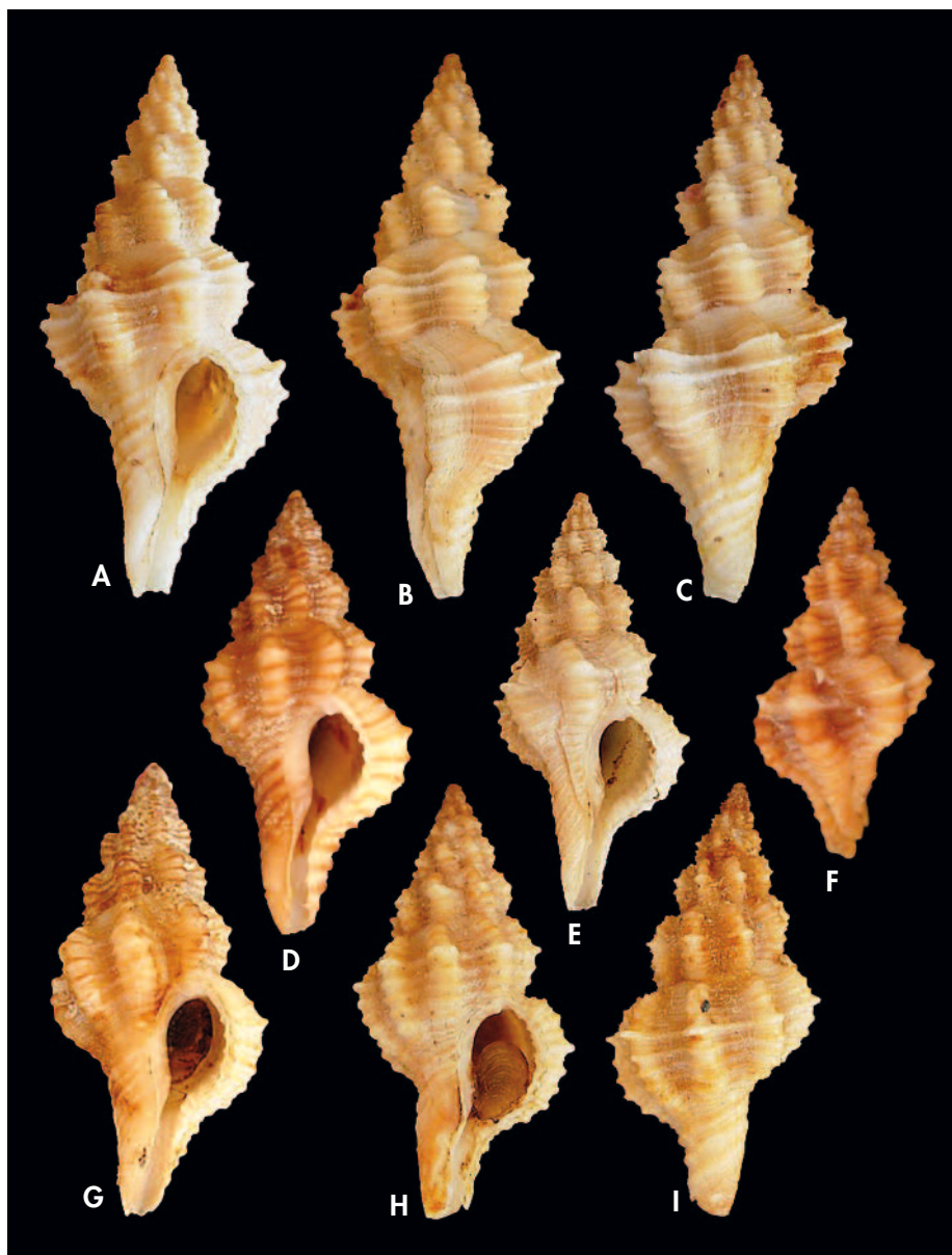
Figure 1. Fusinus buzzurroi n. sp., Mljet Island (Croatia), 60-100 m. A-C: holotype (MNHM Mo 33638), apertural, lateral and dorsal views, 26.4 x 11.7 mm; D: paratype A, apertural view, 21.8 x 10.4 mm; E: paratype I, apertural view, 20.5 x 9.6 mm; F: paratype D, dorsal view, 18.4 x 8.9 mm; G: paratype F, apertural view, 22.4 x 10.2 mm; H, I: paratype B, apertural and dorsal views, 21.4 x 10.7 mm.

Figura 1. Fusinus buzzurroi n. sp., Mljet Island (Croatia), 60-100 m. A-C: holotipo (MNHM Mo 33638), vista apertural, lateral y dorsal, 26,4 x 11,7 mm; D: paratipo A, vista apertural, 21,8 x 10,4 mm; E: paratipo I, vista apertural, 20,5 x 9,6 mm; F: paratipo D, vista dorsal, 18,4 x 8,9 mm; G: paratipo F, vista apertural, 22,4 x 10,2 mm; H-I: paratipo B, vista apertural y dorsal, 21,4 x 10,7 mm.