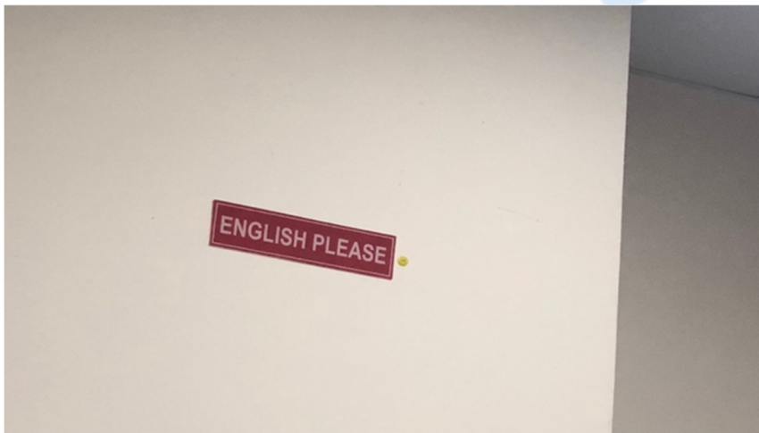
Figure 2.0 “ENGLISH PLEASE” sign on the AUE classroom walls.

The analysis of the classroom observation revealed the monolingual ideology of the senior management enacted by teaching staff, and, to some extent, by the university students. The “English please” sign on the classroom walls illustrates the centripetal forces pulling towards an English-only environment (fig. 2.0).