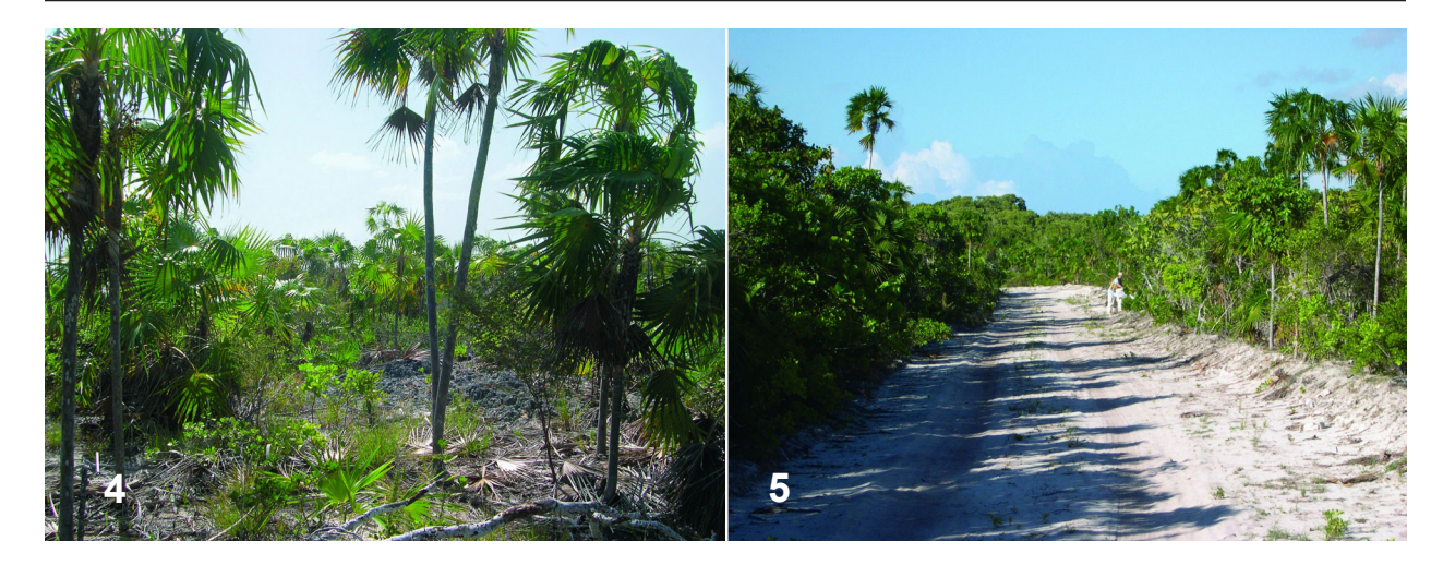
Figure 4-5. 4) Rocky outcrop in Coccothrinax inaguensis forest along south coast of Great Inagua. Photo by M. C. Thomas. 5) Roadside in Coccothrinax inaguensis forest along northwest coast of Great Inagua. Photo by M. C. Thomas.

The male parameres in caudal view resemble those of C. cubana (Chapin), but that species is almost twice the size of C. dolichotarsa , has a shorter antennal club, stout meso- and metatarsomeres, an epipleural flange on the elytral margin of the female, and short, blunt parameres in lateral view.