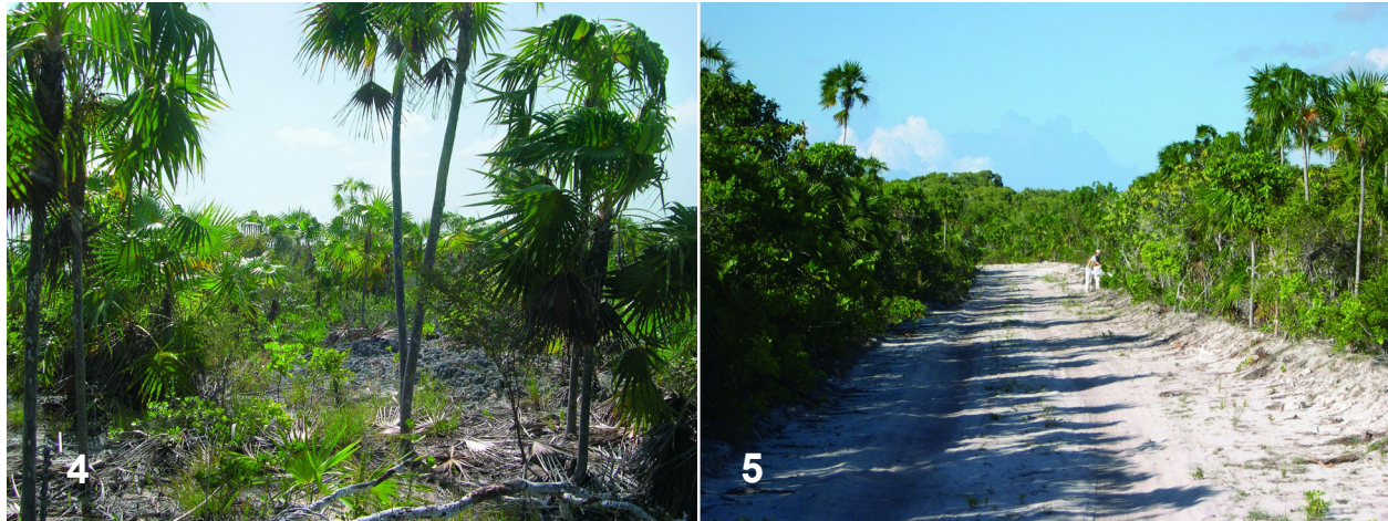
Figure 4-5. 4) Rocky outcrop in Coccothrinax inaguensis forest along south coast of Great Inagua. Photo by M. C. Thomas. 5) Roadside in Coccothrinax inaguensis forest along northwest coast of Great Inagua. Photo by M. C. Thomas.

The male parameres in caudal view resemble those of C. cubana (Chapin), but that species is almost twice the size of C. dolichotarsa , has a shorter antennal club, stout meso- and metatarsomeres, an epipleural flange on the elytral margin of the female, and short, blunt parameres in lateral view.