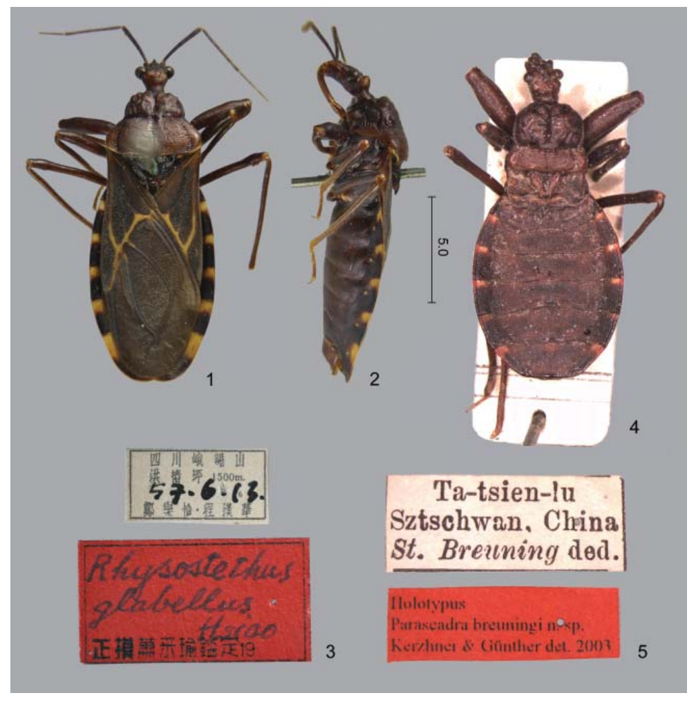
Figs. 1–5. Holotypes (1–2, 4) and their labels (3, 5). 1–3 – Rhysostethus glabellus Hsiao, 1973; 4–5 – Parascadra breuningi Kerzhner & Günther, 2004. Scale bar in mm; labels not to scale. (Figs. 4–5: © ZMAS, photographed by D. A. Gapon, published with permission.)

Type material examined. Rhysostethus glabellus. Holotype: & (macropterous): "['Sichuan Emeishan', in Chinese script, printed] \ ['Hongchunping', in Chinese script] 1500m. [printed] \ 57. 6. 13. [handwritten] \ ['Zheng Le-Yi ' Cheng Han-Hua', in Chinese script, printed]" [square with black frame], "Rhysostethus [handwritten] \ glabellus [handwritten] \ 'Holotype Hsiao Tsai-Yu identified 19' [in Chinese script, printed]" [red square with frame]; pinned, left antenna distad of segment IIIa, right antenna distad of segment IIIb and right hind tarsus missing (NKUM) (Figs. 1–3).