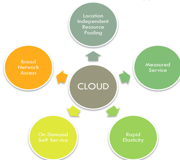
Fig 2. Cloud Computing characteristics (Jaiswal, 2017)

Cloud infrastructure is the first and foremost principle of shared resource storage and use. The NIST (National Institute of Standards and Technology) describes it as a 'model for allowing universal, easy, on-demand network connectivity to a shared pool of configurable computing resources (e.g. networks, servers, storage, software, and services) that can be easily distributed and delivered with little management effort or service provider involvement (Almubaddel & Elmogy, 2016; Jader et al., 2019; Zeebaree et al., 2020). One main advantage of cloud computing, from many angles, is that it uses a pay-as-you-go model that effectively removes the need for service providers to spend on costly networks at an early level. Instead, services are licensed on an as-required basis, allowing cloud resources to be easily updated as needed (Dino, Zeebaree, Salih, et al., n.d.; Mahmood et al., n.d.). This model results in substantial cost savings for all stakeholders involved and provides more efficient access to services on demand. Infrastructure companies allow services readily available by the use of a data center structure to share resources collectively (Jaiswal, 2017).