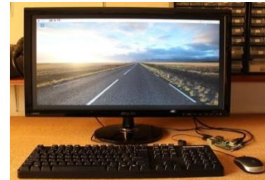
Figure 4. Desktop setup using Raspberry Pi