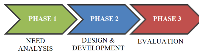
Figure 1. Phase of DDR [10]