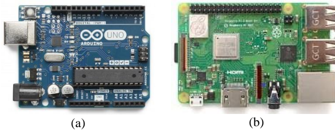
Figure 3. (a) Arduino Uno and, (b) Raspberry Pi (open source microcontroller board)

Python is a high level programming language. Using Raspberry Pi, Python can be used interactively using Python interpreter by typing python in a terminal window [22] or using Python 3 IDLE. Figure 5 shows the example of coding in Python 3 IDLE. Its design philosophy provides code readability with color coding and its syntax allows programmers to express concept in fewer lines of code than would be possible in languages such as C/C++ [23]. Raspberry Pi use Python as a main programming language, but also supports other programming languages, such as C/C++ and Java [24]. The “Pi” in the Raspberry’s name derives from “Python” as the main language offered to users [25].