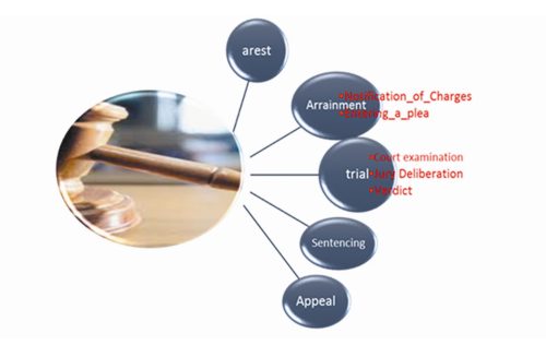
Figure 5: Frame CRIMINAL_PROCESS and its relations (USA)

The criminal process in Moldova represents different steps in comparison with the American criminal process. First, according to Moldova Criminal Procedure Code, there are different procedures for judging an accused charged with murder. The jury's procedure is based on American criminal proceedings.