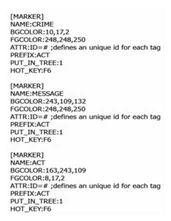
Figure 10: Part of the preferences file used for annotation

PaLinKa, the instrument presented in this paper meets all these requirements and is suitable for annotating legal discourse. The Constitution document was divided into nine XML files that open with another program Notepad ++ is quite simple to install on a PC: