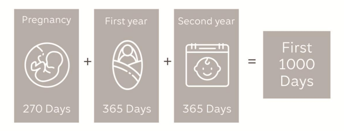
Figure 3. The first 1000 Days of Life – how to count<sup>13</sup>

The exact number "1000 days" is obtained by the sum of three numbers: 270 is the average amount of days during the pregnancy of the human beings, 365 days from birth to the end of the first year and 365 days from year 1 to the end of year 2 (Figure 3).