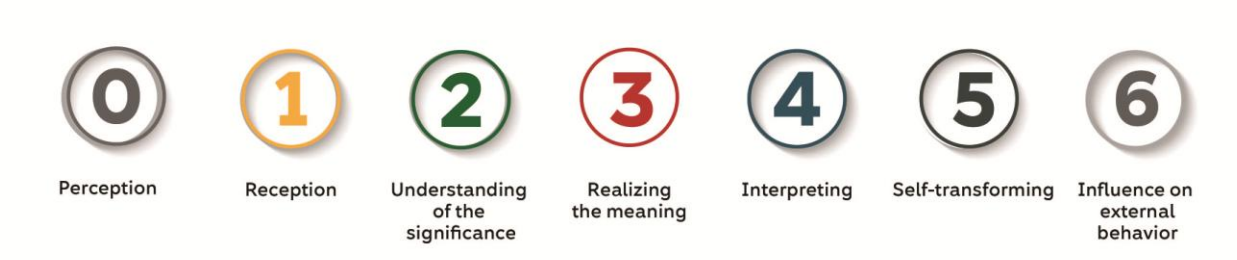
Figure. 1. Lineal reading algorithm<sup>9</sup>

According to the information communication theory of reading, its structure is progressive (step-by-step), and not a holistic one – it is not done "en bloc", even because reading is an unnatural activity for the human nature – it is not inherent, but acquired cultural practice, as Maryanne Wolf already proved<sup>10</sup>. Many neurophysiological studies support our thesis, that the roots of the reading problems are on the input of the reading