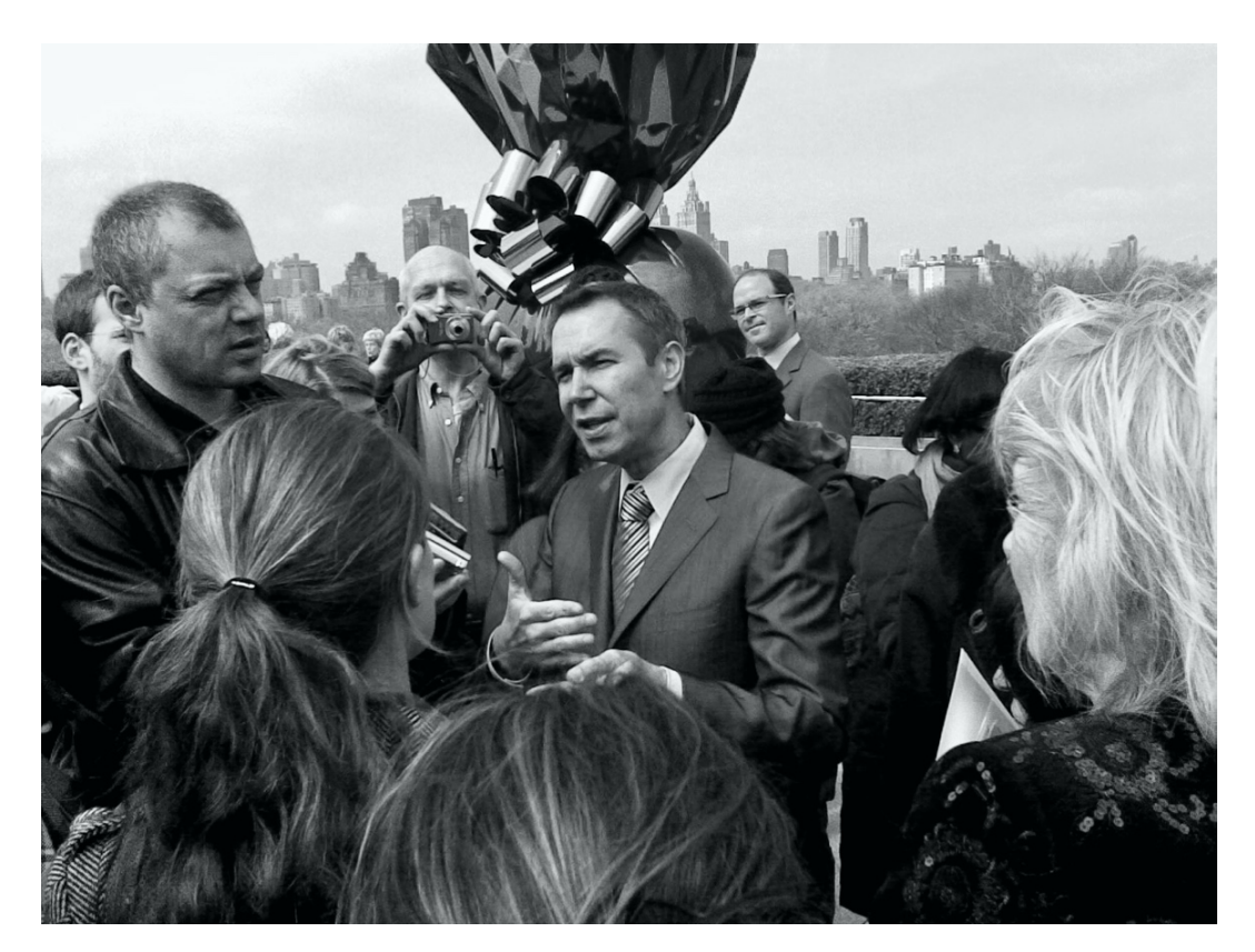
Figue 6: Jeff Koons. Photo by Art Comments. April 20, 2008. Licensed under CC BY 2.0.

It is the main link in the configuration of a triple structure: the public-star media. It is a triple interdependence, periodically recycled by the public and the media, in their political, social, and cultural contexts, or the stars with their ideas and actions for their characteristics, all in new experiences for the image (Fig. 6). Like everything in this market system, art would not escape this relationship of interdependence and would also be playing its role as a coadjuvant and co-author of the new successful images (integrated into the system) as the stars of the capitalist scenario.