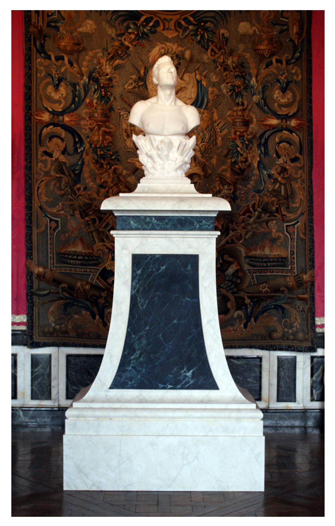
Figure 5: Jeff Koons, Self-Portrait, Made in Heaven series, 1991. Photo by Marc Wathieu. Chateau de Versailles. November 21, 2008. Licensed under CC BY-NC-ND 2.0.