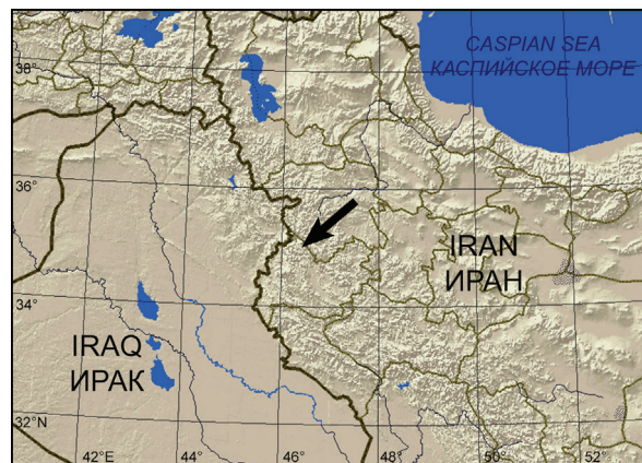
Fig. 19. The geographical location of the type locality. Рис. 19. Географическое положение типового местонахождения.