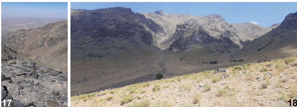
Figs 17–18. The habitat of Plebejus alizadehorum sp. n. in Shaho Mountain, ca 10 km south east of the Paveh town, Zagros Mountains, Iran. 17– the upper part of the valley close to the summit, the clusters of Astragalus are well visible where the males were lekking; 18 – panoramic view of the habitat.