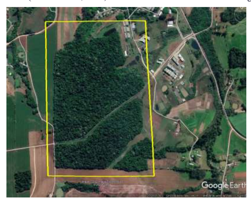
Figure 1. Location of the site of data acquisition. Based on Google Earth Pro scenes. The KML and KMZ are appended to the files.

The data were acquired from an aerial survey conducted with an Unmanned Aerial Vehicle (UAV, also Drone ) covering an forest area of the Federal University of Santa Maria – UFSM in the municipality of Frederico Westphalen, in the Rio Grande do Sul, Brazil (Figure 1). The climate of the region is subtropical (Cfa in the Köppen-Geiger classification) with an average annual temperature of 18 °C and annual precipitation of 1919 mm (Alvares et al., 2013). The rainfall is well distributed throughout the year.