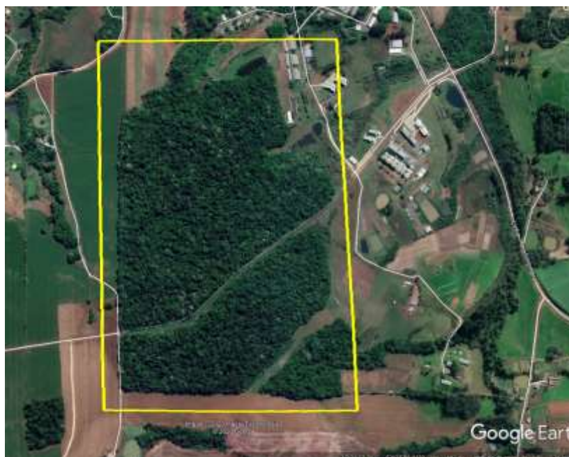
Figure 1. Location of the site of data acquisition. Based on Google Earth Pro scenes. The KML and KMZ are appended to the files.

The data were acquired from an aerial survey conducted with an Unmanned Aerial Vehicle (UAV, also Drone ) covering an forest area of the Federal University of Santa Maria – UFSM in the municipality of Frederico Westphalen, in the Rio Grande do Sul, Brazil (Figure 1). The climate of the region is subtropical (Cfa in the Köppen-Geiger classification) with an average annual temperature of 18 °C and annual precipitation of 1919 mm (Alvares et al., 2013). The rainfall is well distributed throughout the year.