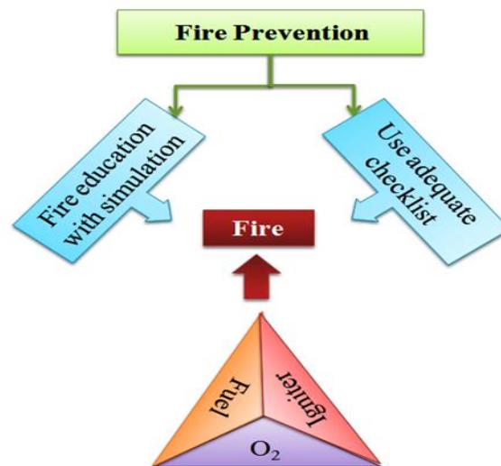
Figure 2 Fire safety prevention models in ORs