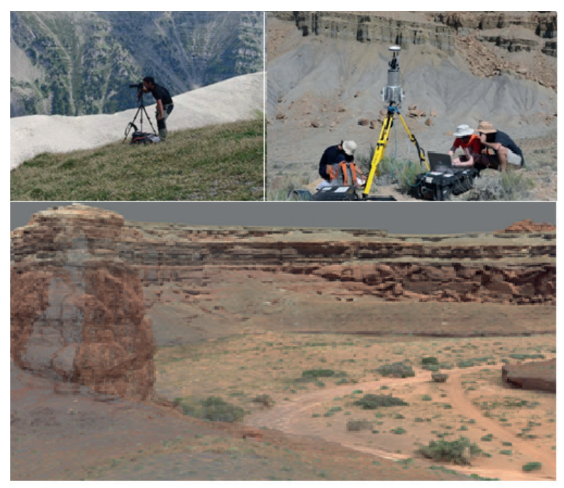
Figure 2: Common Digital Outcrop Modeling (DOM) techniques. Top left: convergent photogrammetry acquisition process. Top right: LIDAR acquisition device. Bottom: DOM of an eolian sandstone outcrop in Utah.

ning similar workflows on outcrop analogs as the ones run on actual petroleum reservoirs: horizon picking, facies interpretation and geostatistical modelling of petrophysical properties (Deschamps et al. 2015). Initially developed for better constraining subsurface models in an indus-