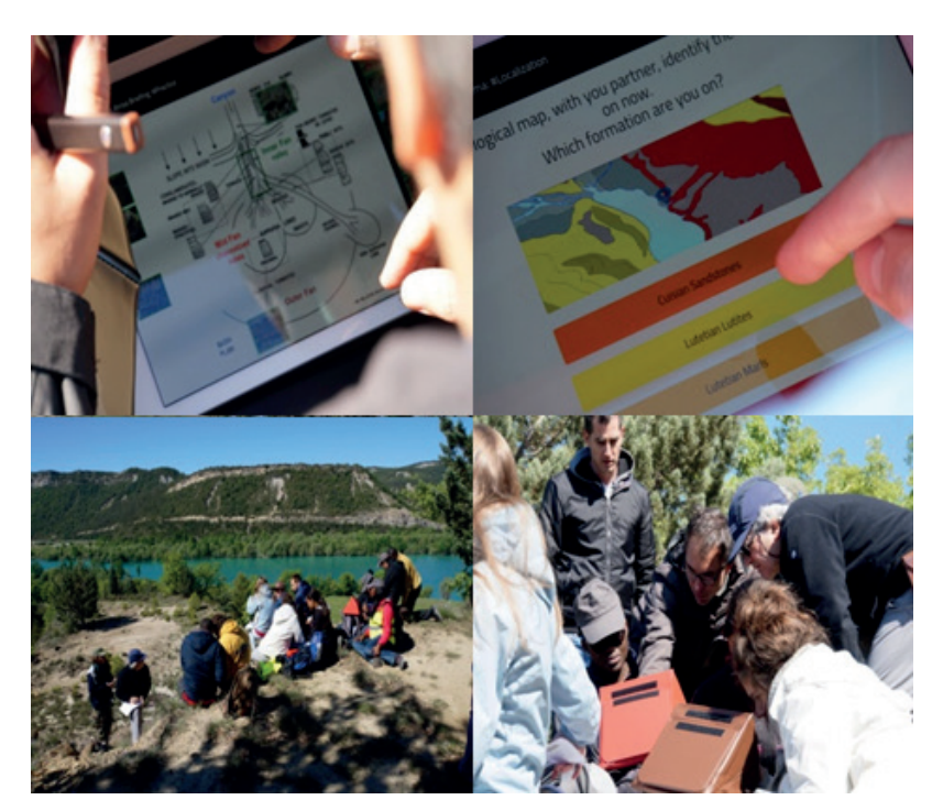
Figure 1: IFP School students using a mobile learning application during a geological field trip in the Spanish Pyrenees in April 2017. Top left: access to reminders on the geological context. Top right: interactive quiz based on the geological map. Bottom left: landscape sketching. Bottom right: discussion with professors.

At IFPEN, DOM technologies were notably developed within the SmartAnalog<sup>TM</sup> project ( https://www.smartanalog. eu/). Relying on a proprietary interpretation platform, this project aimed at run-