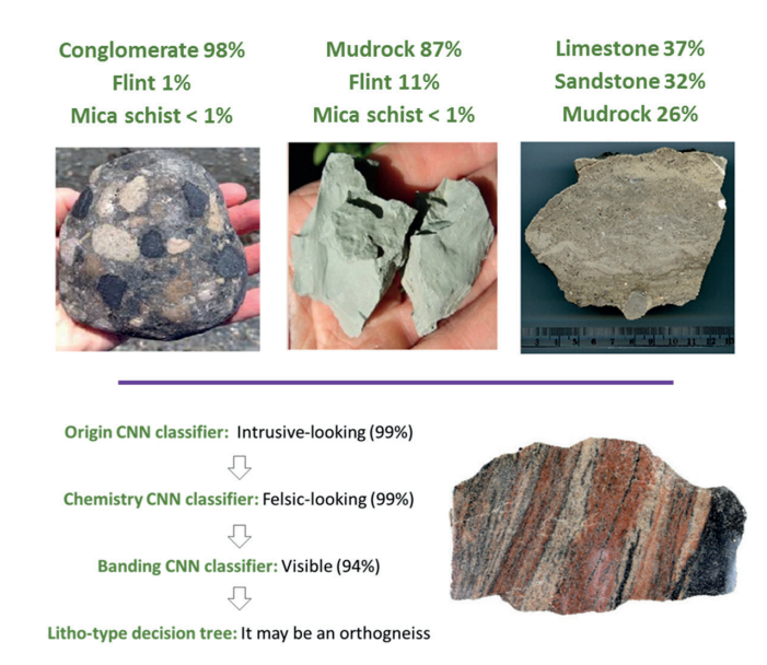
Figure 4: Automated identification of lithofacies on field samples with artificial intelligence algorithms. Top: direct lithology classification. Each input picture displays the three most probable classes according to the neural network. The first two pictures are archetypal and the probabilities neatly favour a single class. However, the third picture is more ambiguous and the probabilities reflect the uncertainty that a human geologist would face. Bottom: lithology classification combining petrological feature recognition and a decision tree. Adapted from Bouziat et al. 2020.

Fortunately for the students, there is no need to be an information technology expert to apply the most common techniques in computer and mathematical sciences. Indeed, these techniques have recently seen a tremendous increase in accessibility, notably through the rapid growth in community and open-source programming libraries. For instance, a decade ago, geologists wanting to train a neural network on a data set had to code one more or less from scratch in native Python language. Nowadays, they can rely on at least two stages of higher-level libraries, such as PyTorch ( https://pytorch.org/ ) and Ignite (https://pytorch.org/ignite/). This considerably reduces the barrier for non-specialists and these geologists may