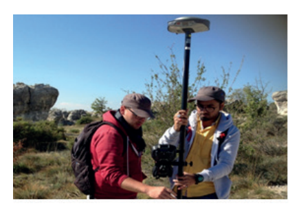
Figure 5: Students from the Petroleum Data Management programme at IFP School acquiring GNSS measurements. They learned how to georeference geoscience data during a geological field trip in Forcalquier (France) in September 2020.

While there are many advantages for aspiring geoscientists to learn some computer and mathematical science, the opposite seems also true. Geosciences involve 4D thinking, numerous data of diverse nature, scale and format and various models with multiple parameters of uncertain values. Thus they are an unexpectedly stimulating playground for students or professionals with a numerical background. Consequently, learning some basics of geology, even at a late stage of their training, can open some interesting paths for scientists with these profiles, notably in the subsurface resources industries. Some