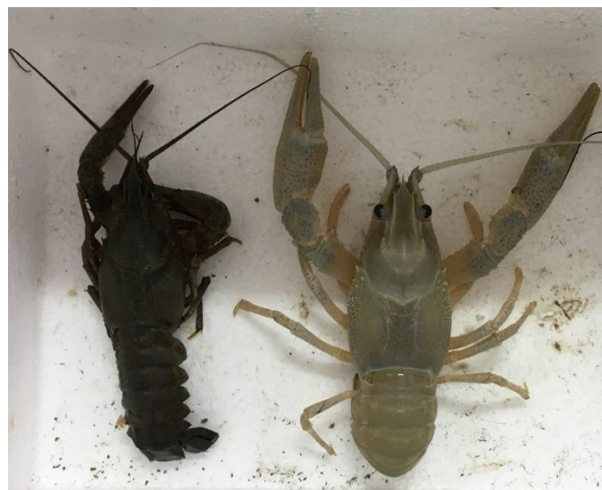
Figure 3. Comparison of normal crayfish and the albino crayfish from Atkhisar Reservoir, Çanakkale, Turkey

crayfish is unequivocally different from normal crayfish.