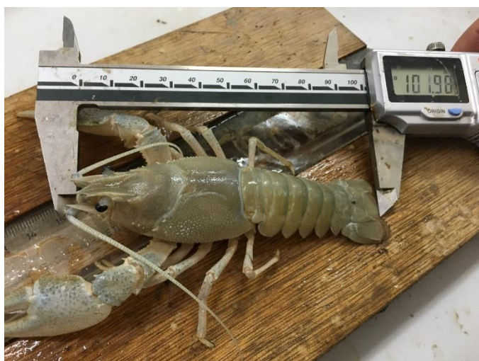
Figure 2. The albino crayfish individual captured from Atkhisar Reservoir, Çanakkale, Turkey

A comparison of the albino crayfish and normal crayfish was provided for better understanding the colouration between two types of the phenotype (Figure 3). It can be clearly seen that the colour of the albino