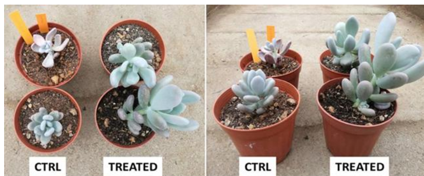
Figure 4 Improvement of vegetative growth in Pachyphytum oviferum after the treatment with Trichoderma harzianum