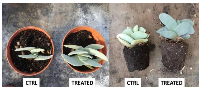
Figure 5 Improvement of vegetative growth in Crassula falcata after the treatment with Trichoderma harzianum

Table 2-3 show how the use of Trichoderma harzianum can significantly influence photosynthesis and chlorophyll content in Pachyphytum oviferum and Crassula falcata . In particular 12.66 \mu\text{mol m}^{-2} \text{s}^{-1} for (TH) compared to 11.39 (CTRL) (Table 1) and 12.33 \mu\text{mol m}^{-2} \text{s}^{-1} for (TH) compared to 11.15 \mu\text{mol m}^{-2} \text{s}^{-1} (CTRL) for plant photosynthesis (Table 2). Same trend for leaf chlorophyll content, 20.36 (TH) compared to 14.40 in (CTRL) (Table 1) and 17.89 (TH) compared to 13.18 in the untreated control (Table 2).