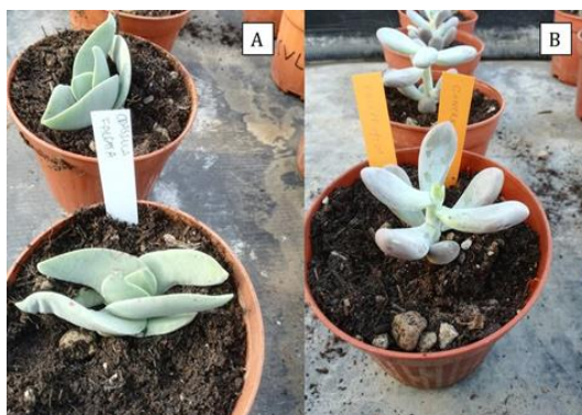
Figure 1 Detail of Crassula falcata (A) and Pachyphytum oviferum (B) in greenhouse at CREA-OF in Pescia (PT)

On 5 September 2019, plant height, number of leaves, vegetative and root weight, number of new shoots, stem diameter, number of inflorescences and flowers, flower duration, Pn (LI-6400XT Portable Photosynthesis System, ten days before destructive analysis), chlorophyll content (FieldScout CM 1000 Chlorophyll Meter) were recorded. In addition, the number of plants out of the total affected by Rhizoctonia solani was evaluated.