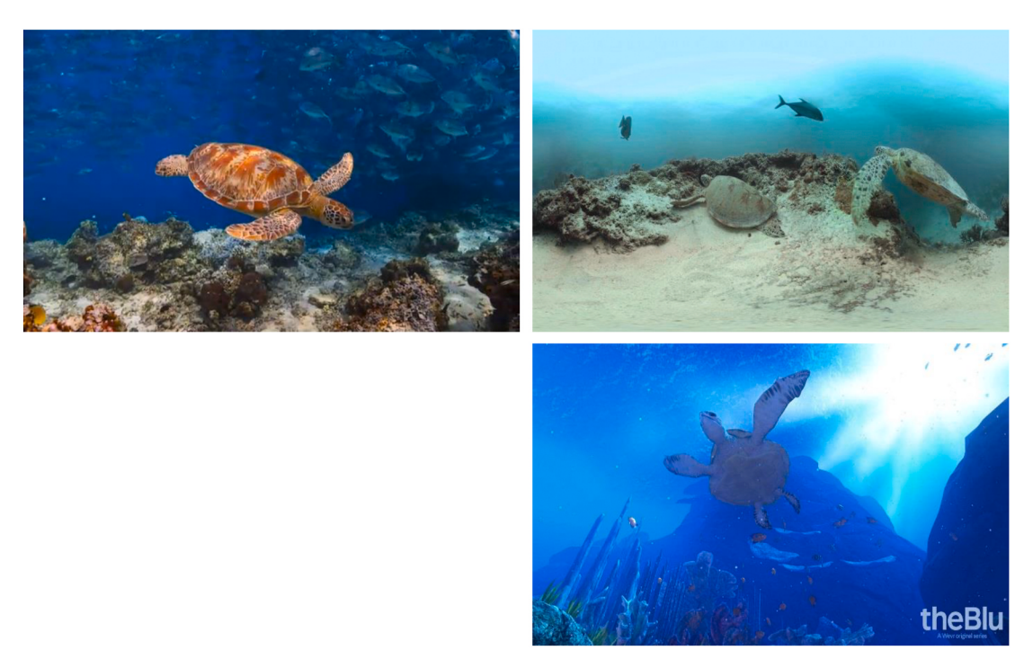
Fig. 2. Example stills from the TV (above left), 360-VR (above right) and CG-VR (below right) exposure conditions.

Experienced presence. The sum score of five items from the Presence and Reality Judgement Questionnaire (Baños et al., 2000), which was specifically developed for virtual environments, was used to measure experienced presence. Items with high factorial loadings representing each of the scale's three factors (reality judgement, internal/external correspondence and attention/absorption) were selected based on applicability to the current work. Participants gave ratings on a 0–10 Likert scale; sum scores potentially ranged 0–50. Internal consistency for