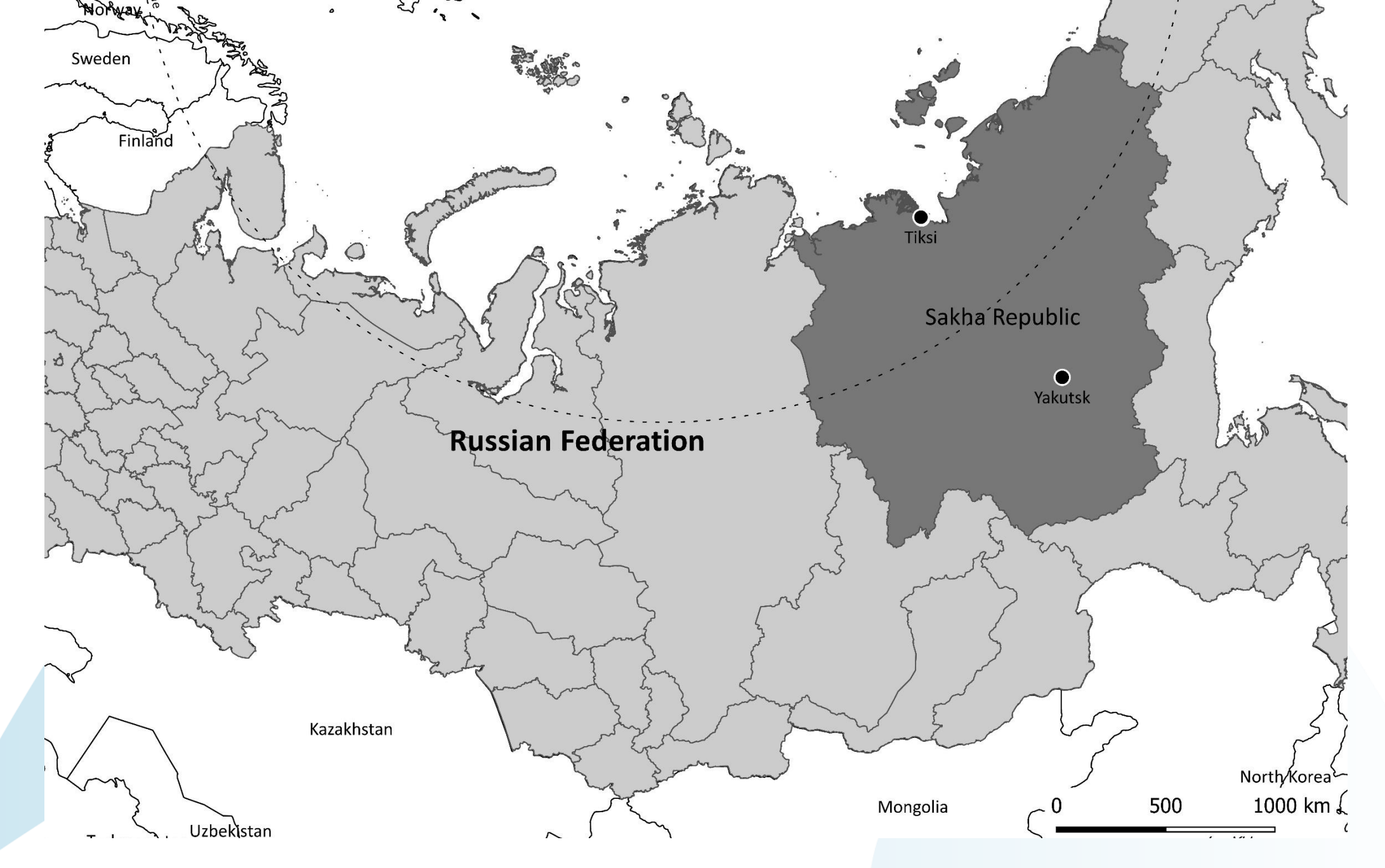
Map of Sakha Republic (Russian Federation).