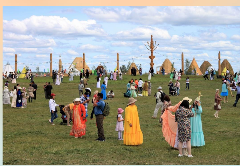
Ysyakh Festival – June 2018