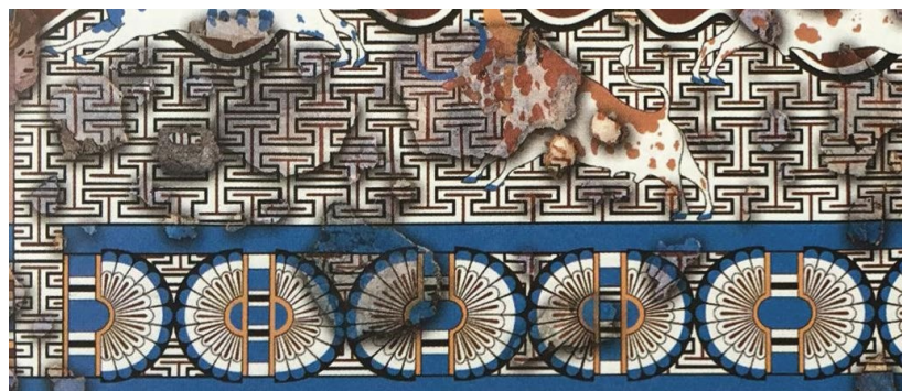
■ Figure 3. Detail of reconstruction of a bull leaper fresco, ancient Avaris, sixteenth-century BCE (McInerney 2011: 12).