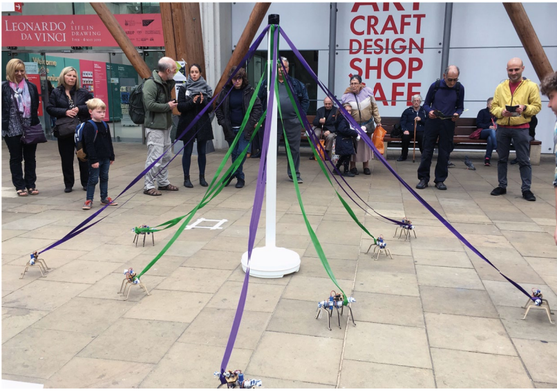
■ Figure 4. The start of a PENELOPEan performance, Millenium Gallery, Sheffield, 2019.

It is obvious by now that the knowledge we grapple with here is inextricably at once embodied practice, reflexive decision-making and material agency. In particular, the challenge is to highlight non-propositional knowledge, and illuminate the conditions of intelligibility of such knowledge (Schatzki et al. 2001: 10), to reconsider dichotomies between human and non-human entities. It is here that performance and the concept of microperformativity become key to our project of weaving, one that addresses both challenges that we have set ourselves; first, what do the weavers know, when they know how to weave? Second, how do we grasp and represent that complex knowledge.