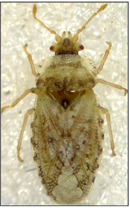
Fig. 1. Parapiesma quadratum (dorsal view)

Distribution in Palaearctic: Europa: Austria, Belgium, Bosnia-Herzegovina, Bulgaria, Croatia, Czech Republic, Finland, Germany, Great Britain, Hungary, Ireland, Italy, Macedonia, Polond, Portugal, Romania, Russia (European part), Serbia, Slovakia, Slovenia, Spain, Swedish, Ukraine. North Africa: Algeria, Tunusia. Asia: Armenia, Azerbaijan, Turkey (Asian part) (Heiss & Pericart, 2001) (Fig. 2b).