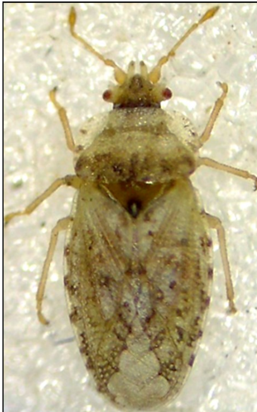
Fig. 1. Parapiesma quadratum (dorsal view)

Distribution in Palaearctic: Europa: Austria, Belgium, Bosnia-Herzegovina, Bulgaria, Croatia, Czech Republic, Finland, Germany, Great Britain, Hungary, Ireland, Italy, Macedonia, Poland, Portugal, Romania, Russia (European part), Serbia, Slovakia, Slovenia, Spain, Swedish, Ukraine. North Africa: Algeria, Tunisia. Asia: Armenia, Azerbaijan, Turkey (Asian part) (Heiss & Pericart, 2001) (Fig. 2b).