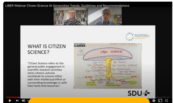
Webinar: Citizen Science At Universities Trends, Guidelines and Recommendations

INOS. We held a 3-day workshop on Citizen Science as well as 2 workshops (LTTA) for our consortium partners on research data management, FAIR data, and open science implementation.