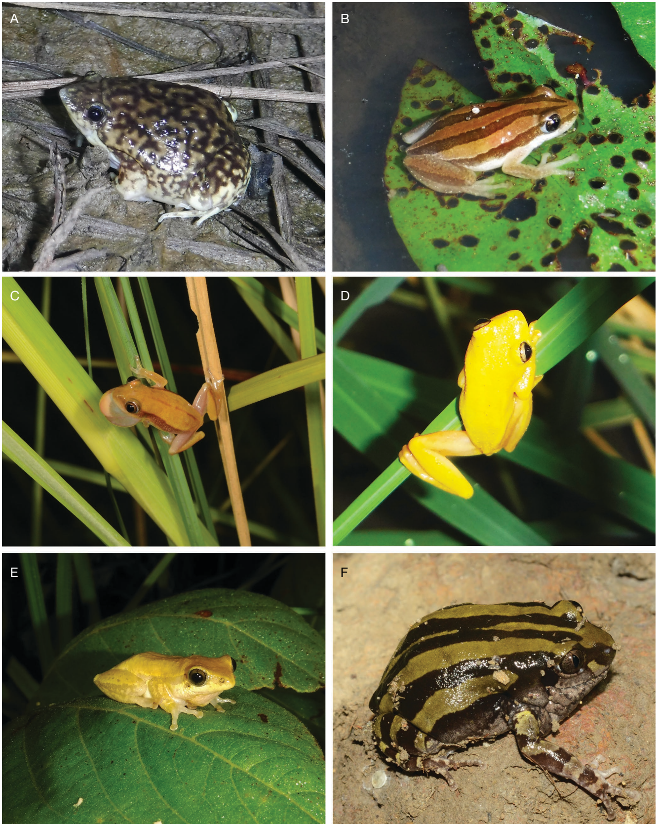
FIG. 4. — Representatives of anuran species from Burkina Faso in life. A , Hemisus marmoratus (Peters, 1854); B , Afrixalus vittiger (Peters, 1876) C , Afrixalus weidholzi (Mertens, 1938); D , Hyperolius concolor concolor (Hallowell, 1844); E , Hyperolius nitidulus Peters, 1875; F , Kassina cassinoidea (Boulenger, 1903).