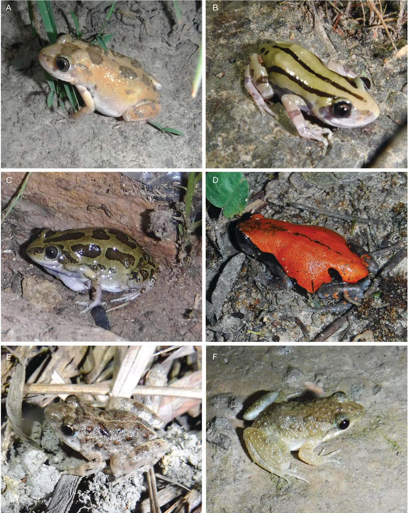
FIG. 5. — Representatives of anuran species from Burkina Faso in life. A , Kassina fusca Schiøtz, 1967; B-C , Kassina senegalensis (Duméril & Bibron, 1841); D , Phrynomantis microps Peters, 1875; E , Phrynobatrachus francisci Boulenger, 1912; F , Phrynobatrachus latifrons Ahl, 1924.