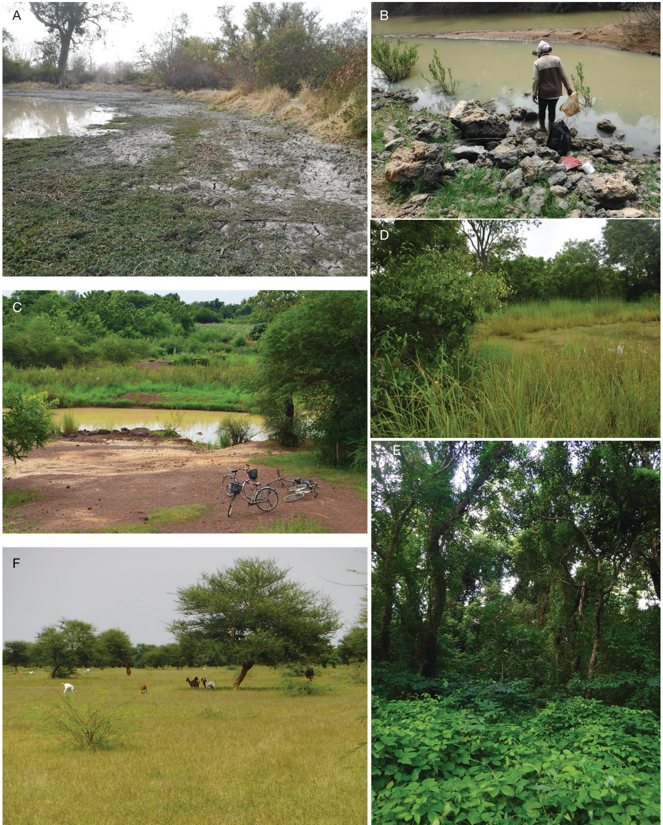
FIG. 2. — Various habitats of amphibian species from Burkina Faso. A, banks of ponds in dry season from W National Park; B, stones on the bank of the Mékrou River in dry season (W National Park); C, shrubby savannah habitats at rainy season from Koubri; D, rainy season shrubby savannah habitats from Comoé-Léraba Forest; E, gallery forest from Kou Forest at Nasso; F, Sahelian swampy valley habitat from Dori (in rainy season).