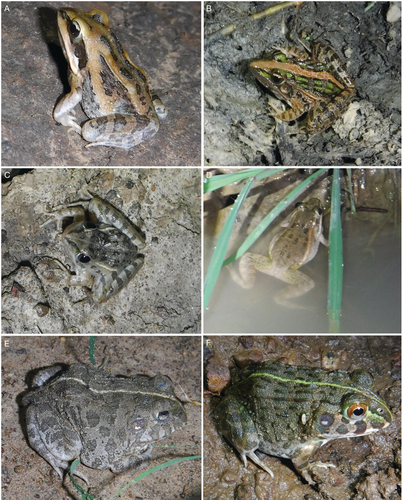
FIG. 6. — Representatives of anuran species from Burkina Faso in life. A , Hildebrandtia ornata (Peters, 1878); B-C , Ptychadena pumilio (Boulenger, 1920); D , Ptychadena schillukorum (Werner, 1908); E-F , Pyxicephalus maltanii (Boulenger, 1882).